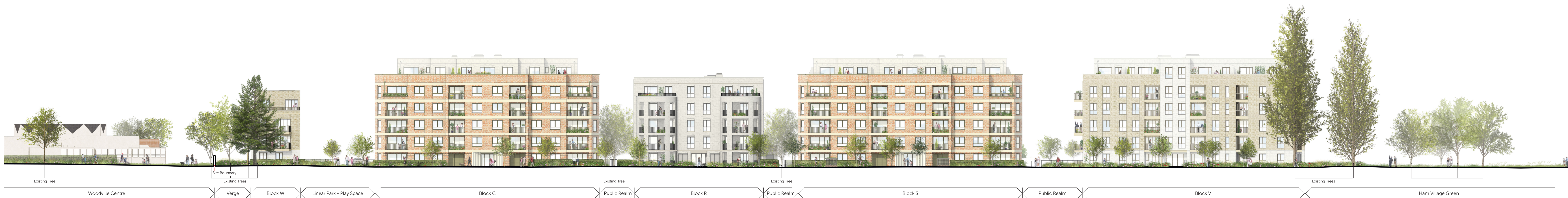
Elevation 03 - Linear Park North Scale 1:250