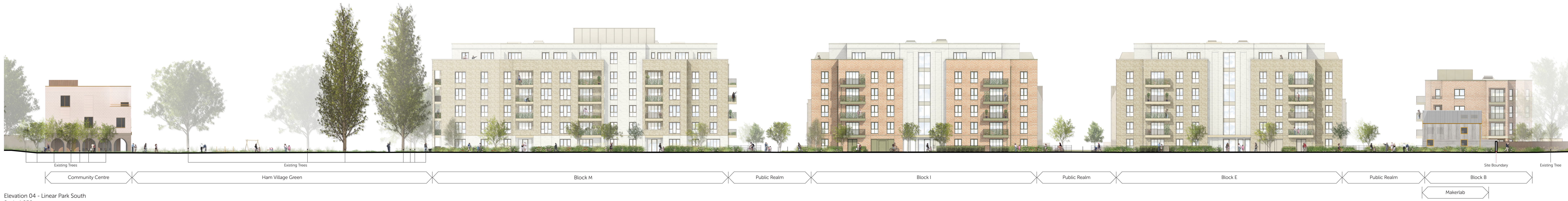
Elevation 04 - Linear Park South Scale 1:250