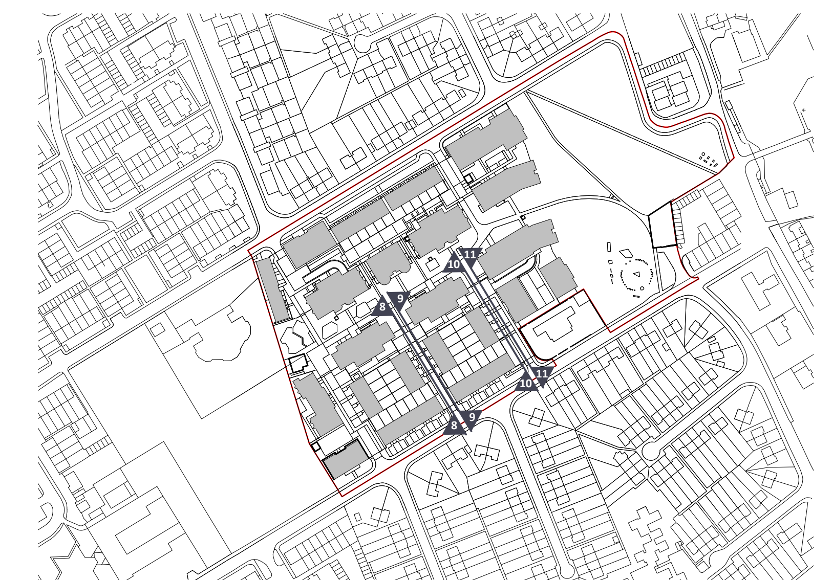
Location Plan 1 : 2500