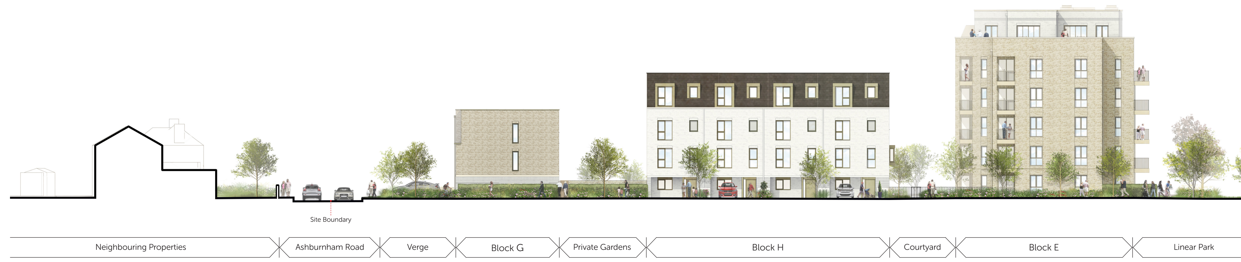
Elevation 8 - Internal Street Elevation Scale 1:250