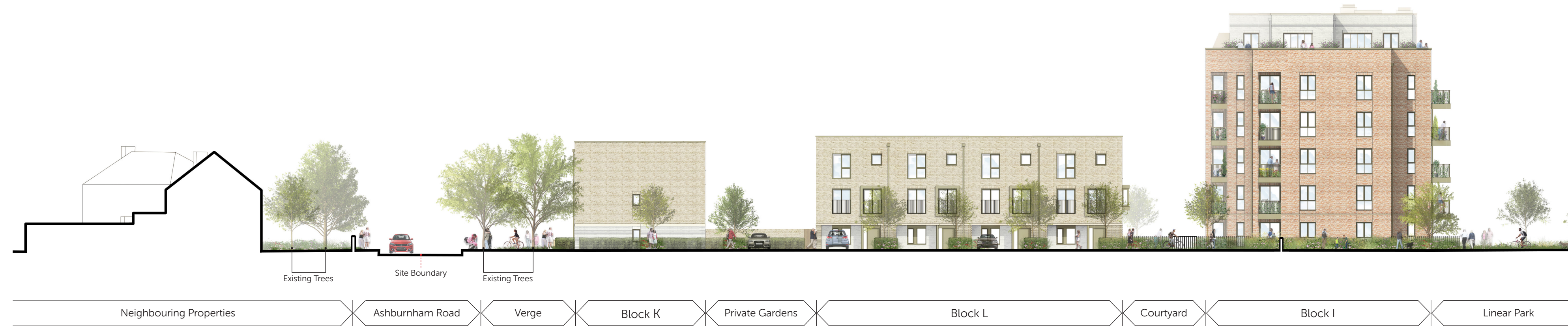
Elevation 10 - Internal Street Elevation Scale 1:250