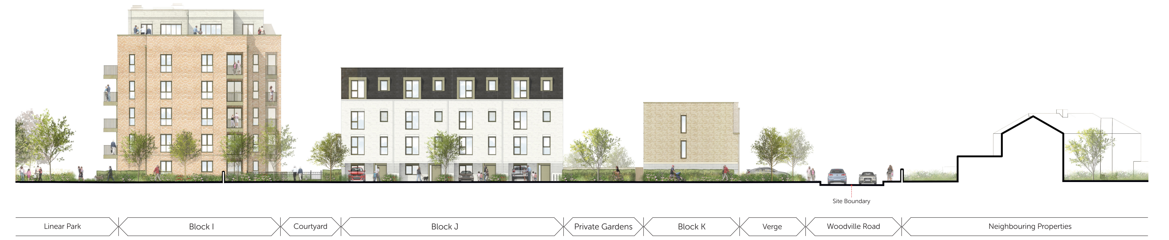
Elevation 9 - Internal Street Elevation Scale 1:250