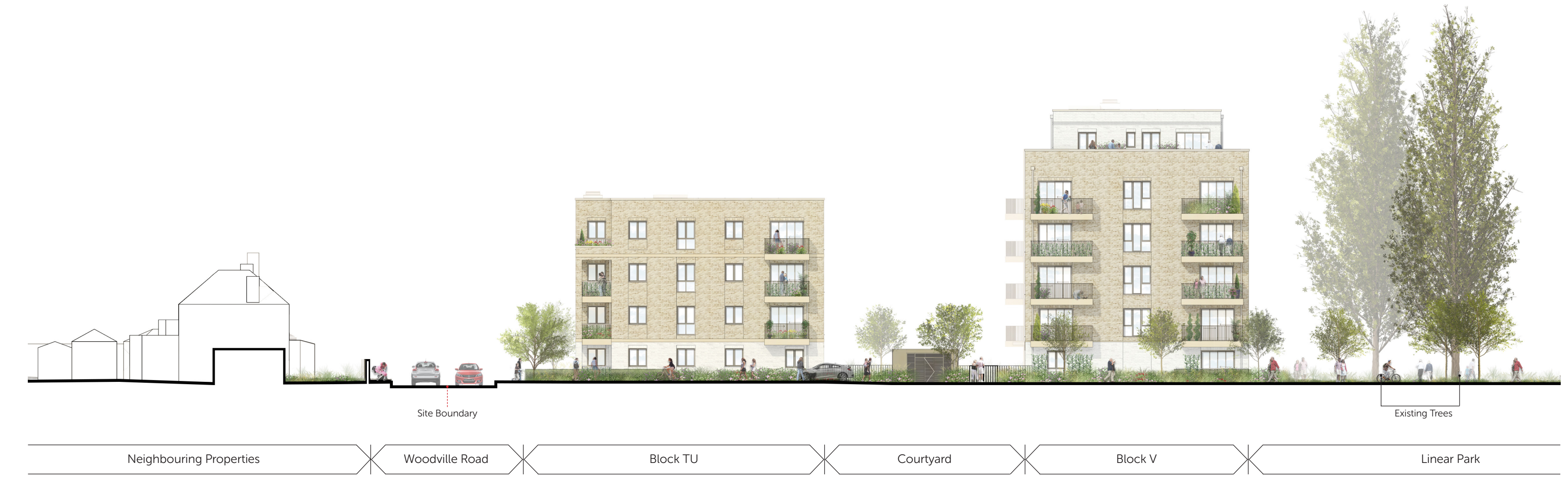
Elevation 13 - Internal Street Elevation Scale 1:250