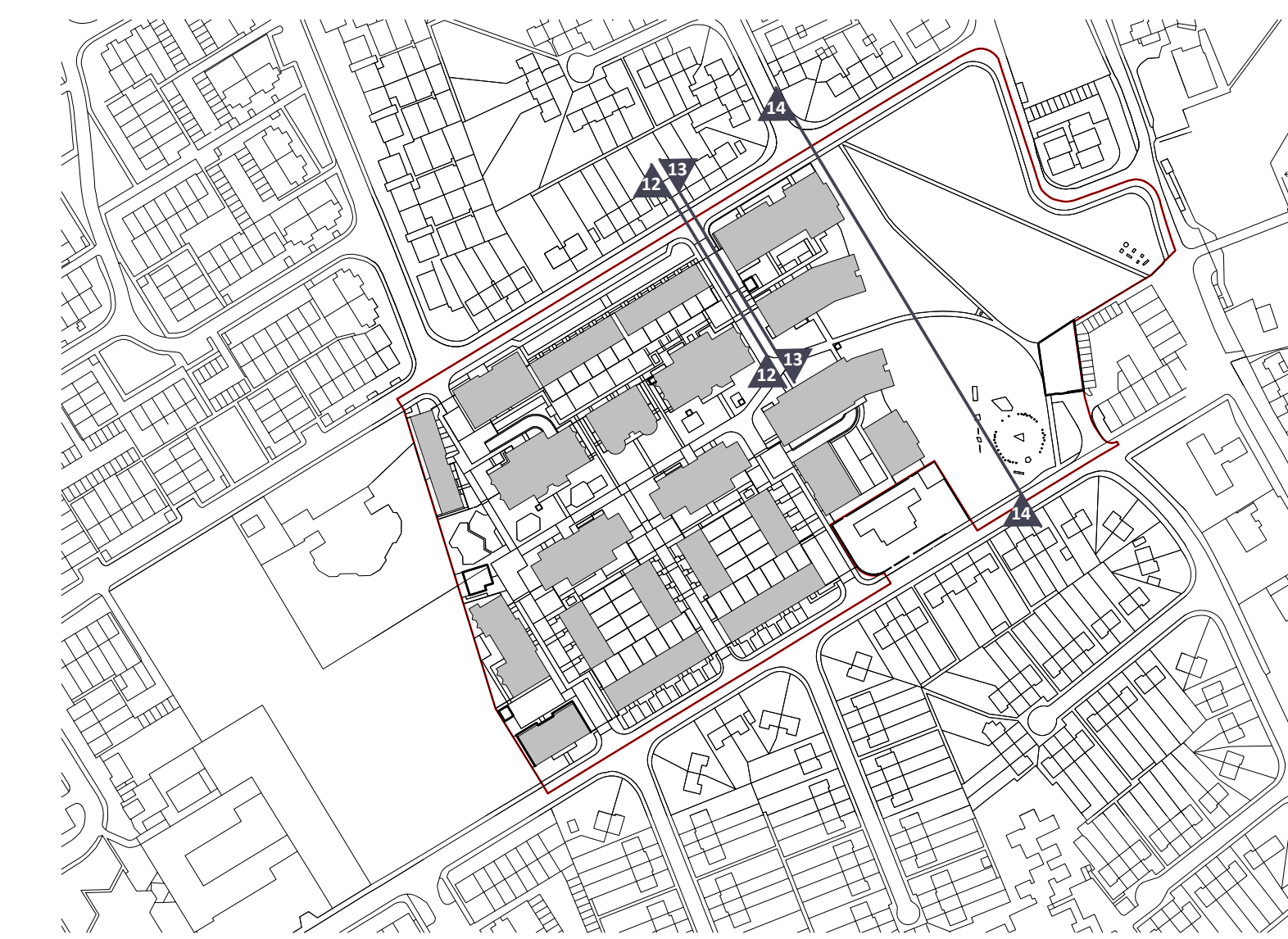
Location Plan 1:2500