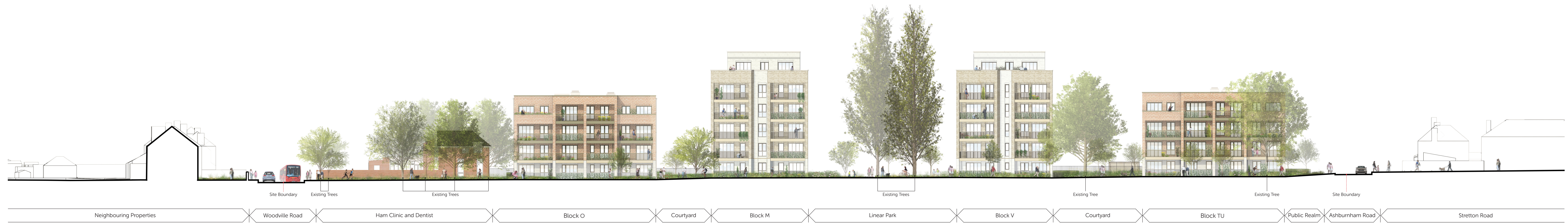
Elevation 14 - Village Green Scale 1:250