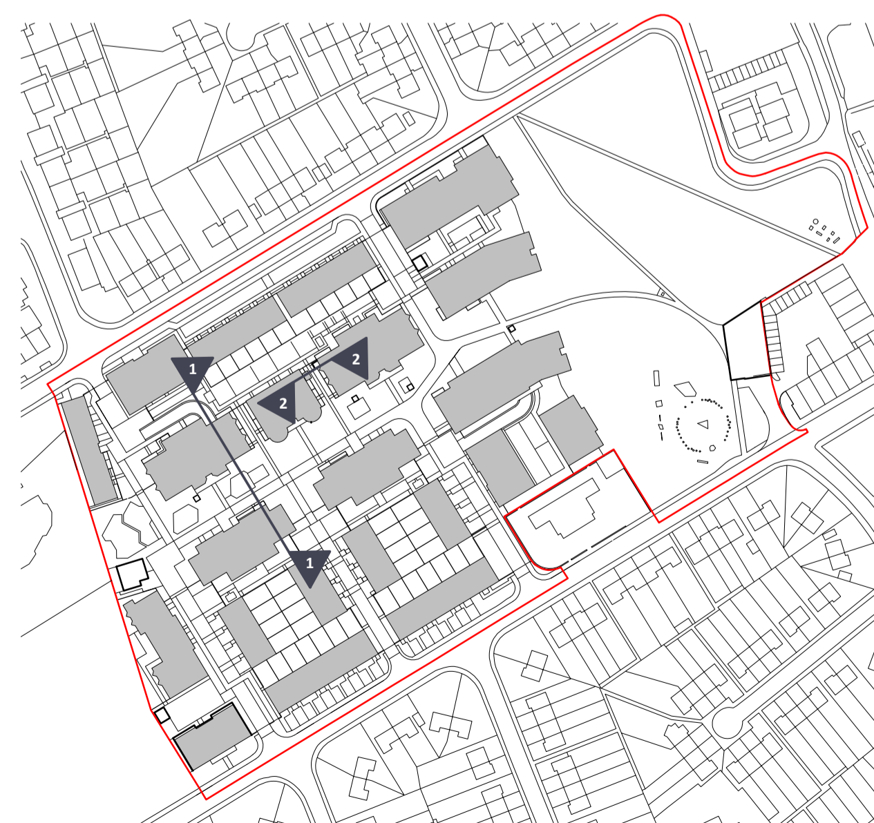
Location Plan 1:2000