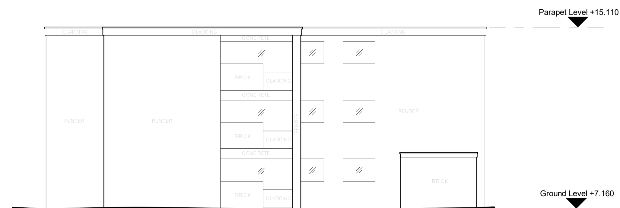
Hatch House - 79 North-East Elevation

Notes: Do not scale. All dimensions are in millimetres unless otherwise stated. This drawing should be read in conjunction with all relevant project information and contract documentation. All dimensions to be checked prior to fabrication and/or commencement of works. All works to comply with all relevant legal standards, building regulations and warranty provider requirements. Report any discrepancies, if in doubt ask.