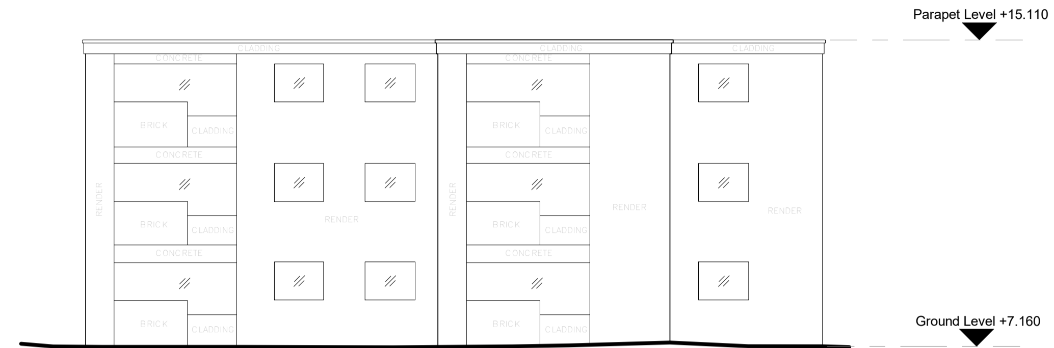
Hatch House - 77 South-West Elevation