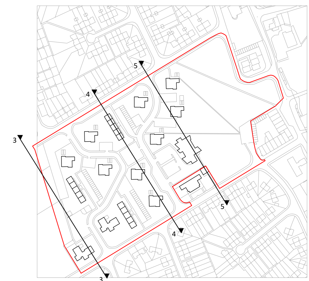
Location Plan 1:2500

Notes: Do not scale. All dimensions are in millimetres unless otherwise stated. This drawing should be read in conjunction with all relevant project information and contract documentation. All dimensions to be checked prior to fabrication and/or commencement of works. All works to comply with all relevant legal standards, building regulations and any early provider requirements. Report any discrepancies, if in doubt ask.