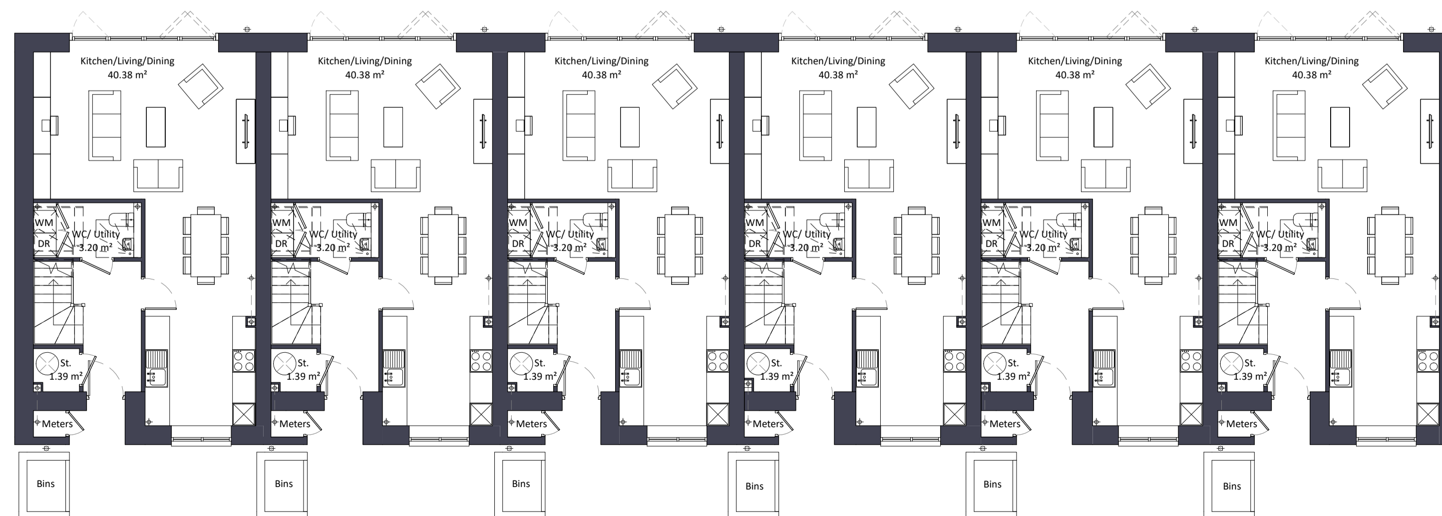
1 Ground Floor 1 : 100