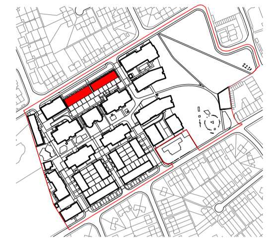
Location Plan 1 : 5000

Notes: Do not scale. All dimensions are in millimetres unless otherwise stated. This drawing should be read in conjunction with all relevant project information and contract documentation. All dimensions to be checked prior to fabrication and or commencement of works. All works to comply with all relevant legal standards, building regulations and warranty provider requirements. Report any discrepancies, if in doubt ask.