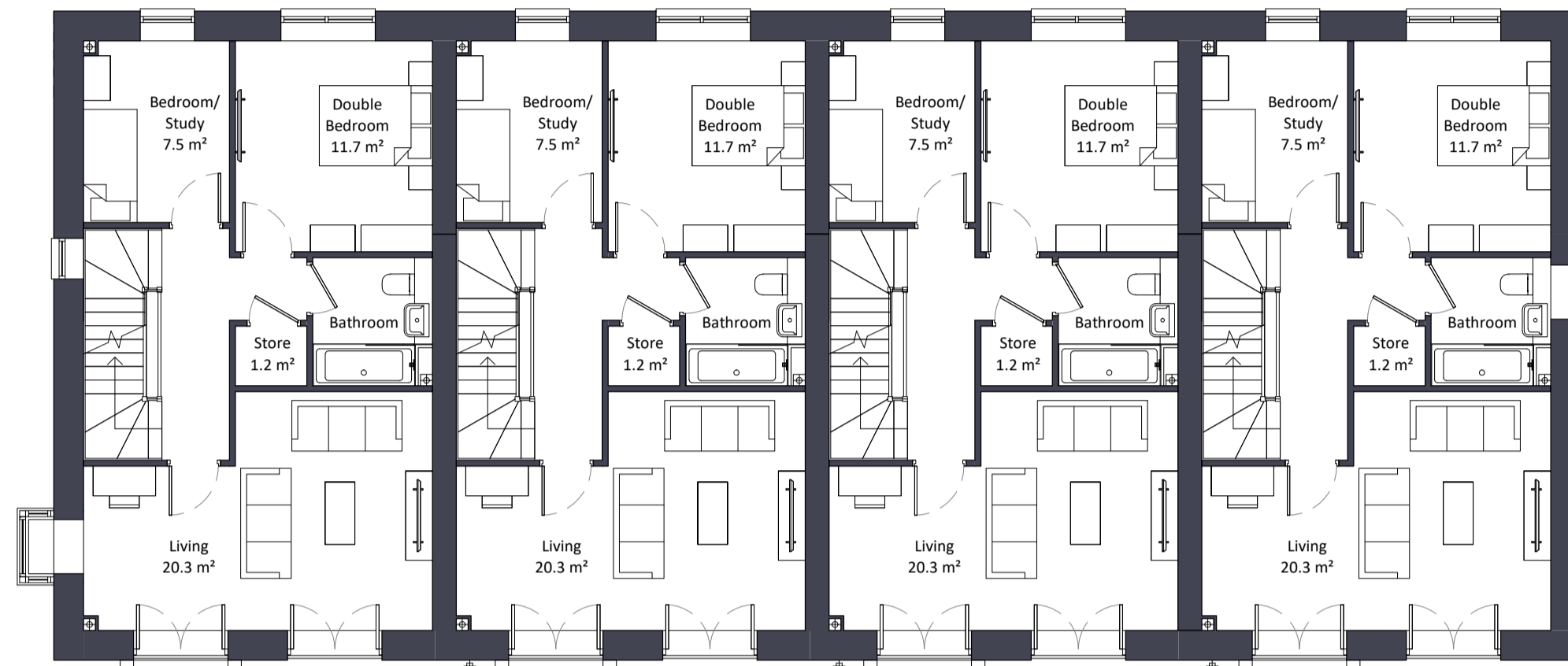
2 First Floor 1 : 100