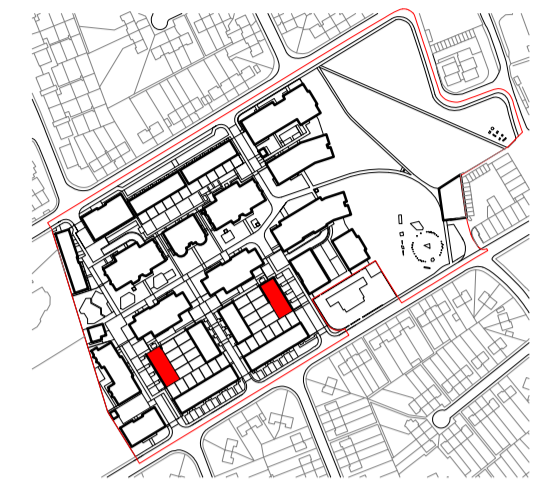
Location Plan 1 : 5000