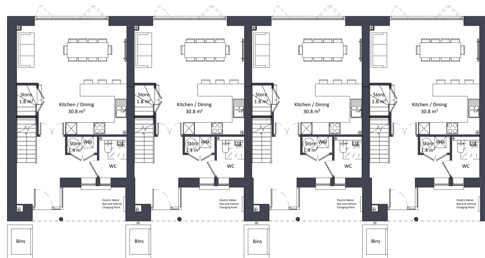
1 Ground Floor 1 : 100