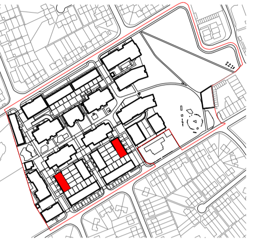
Location Plan 1 : 5000