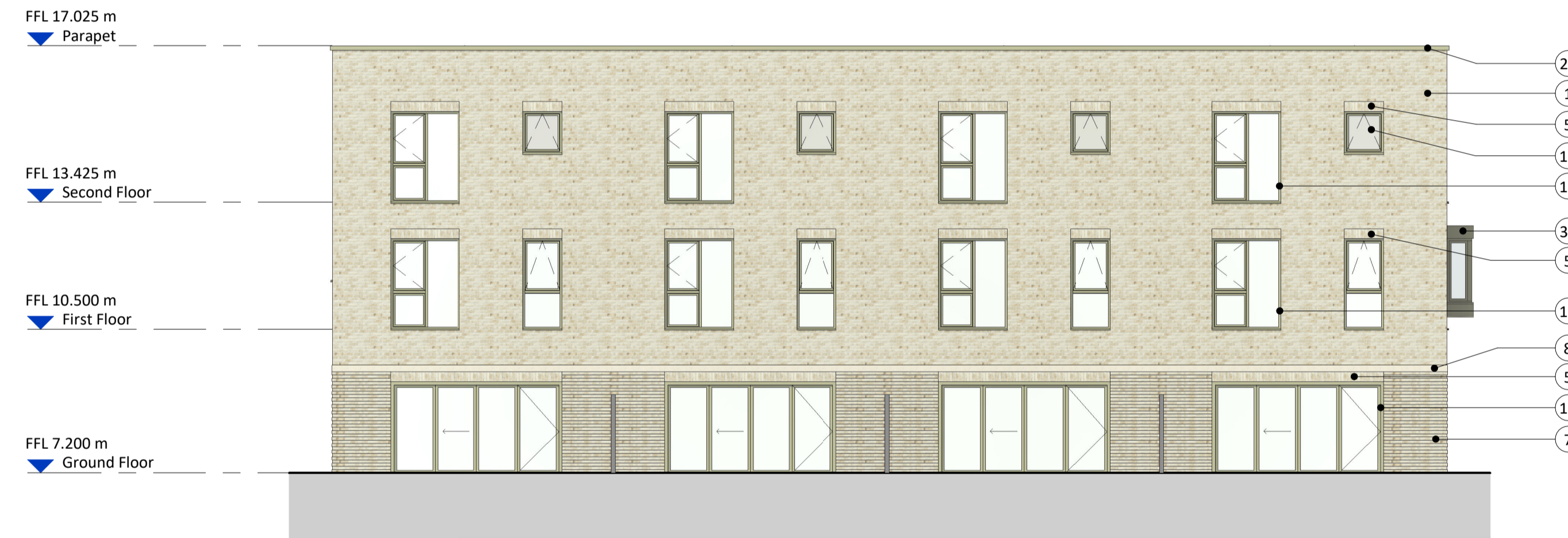
2 Elevation 2 1 : 100