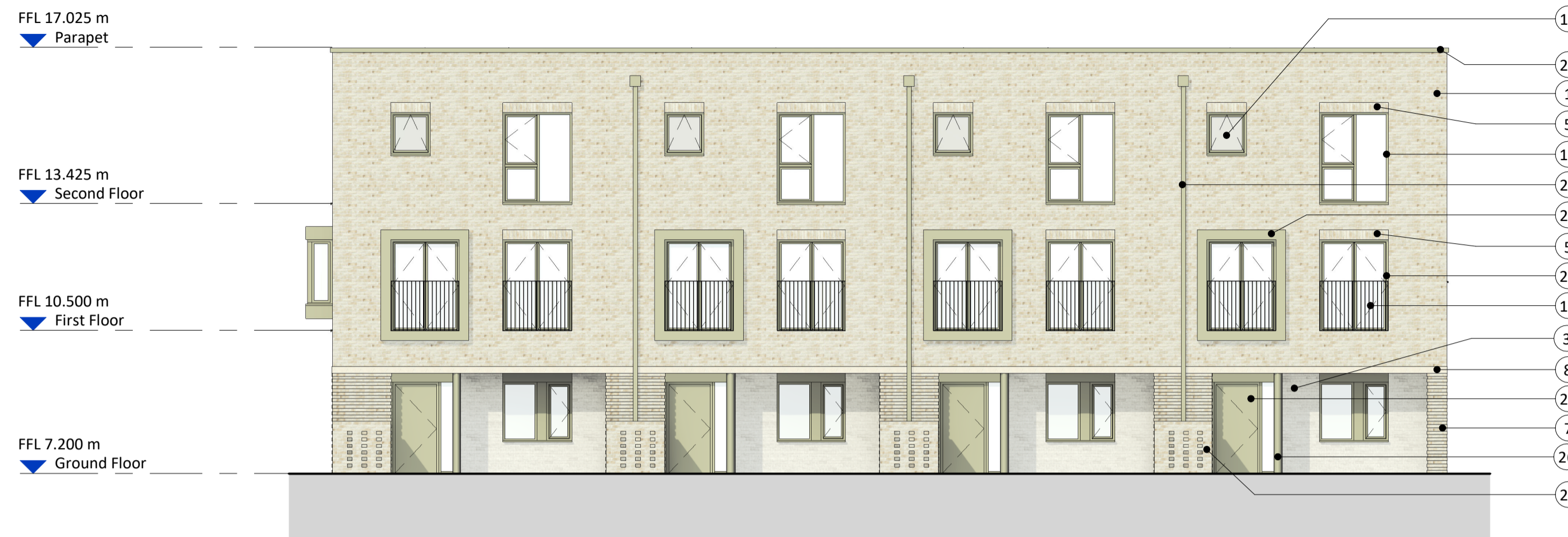
1 Elevation 1 1 : 100