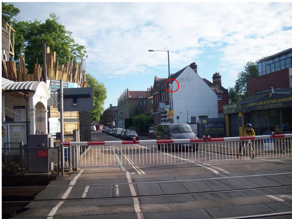
3. Level crossing with traffic queuing from Mortlake roundabout – note cameras