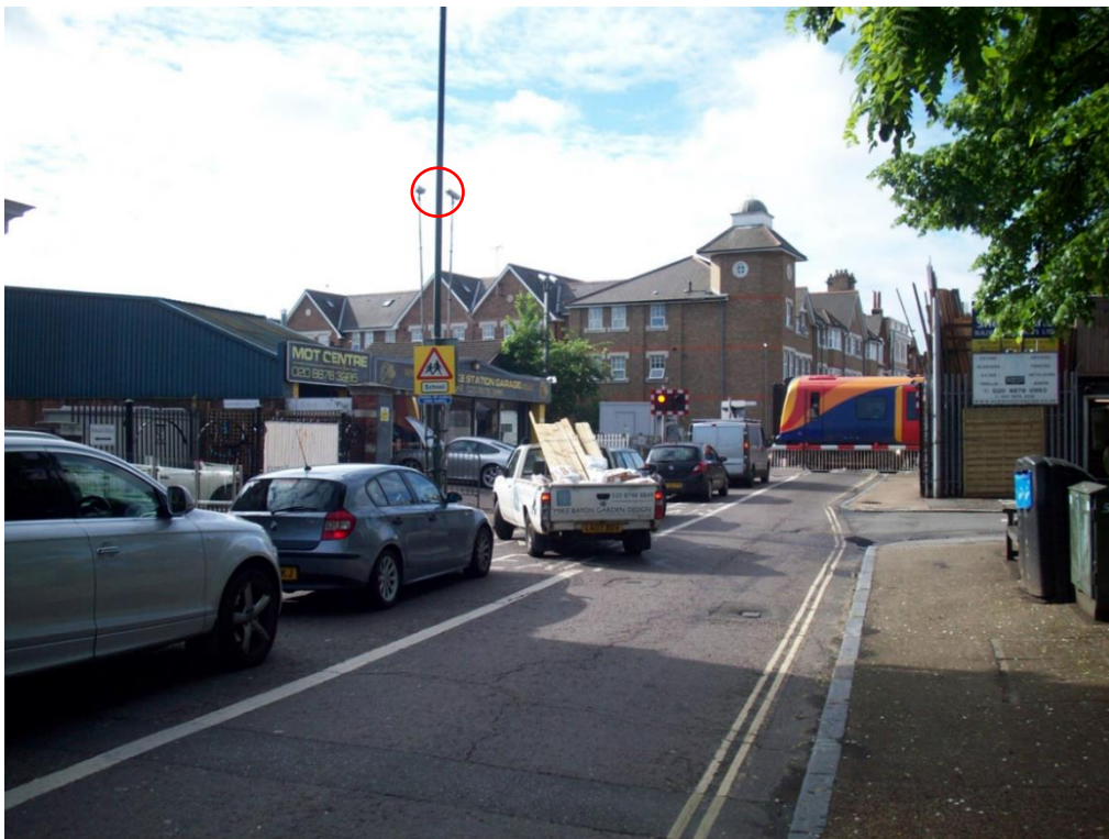
5. Queue approaching level crossing from Mortlake roundabout – note cameras