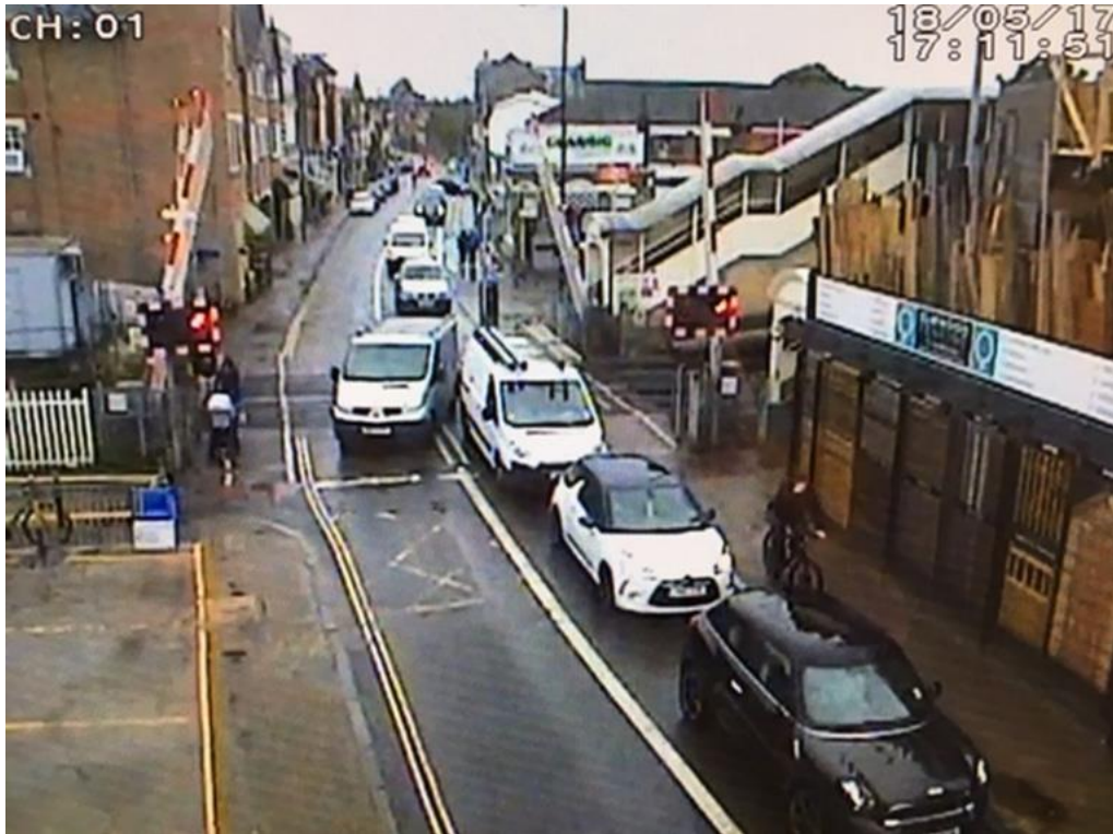
6. Sheen Lane crossing from the camera seen in the previous three photos