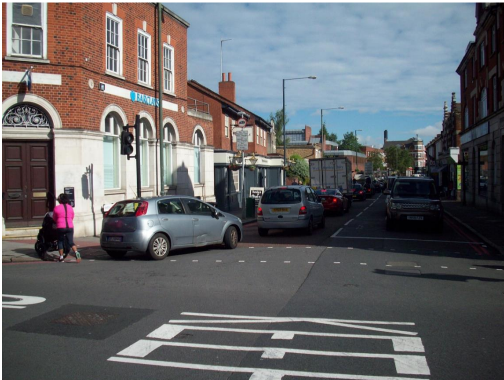
1. Queue off Upper Richmond Road into Sheen Lane approaching level crossing