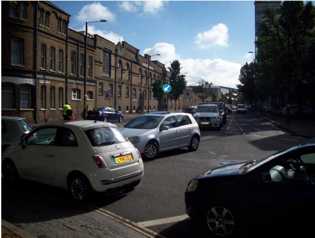
8. Mortlake roundabout with queue approaching from Mortlake High Street