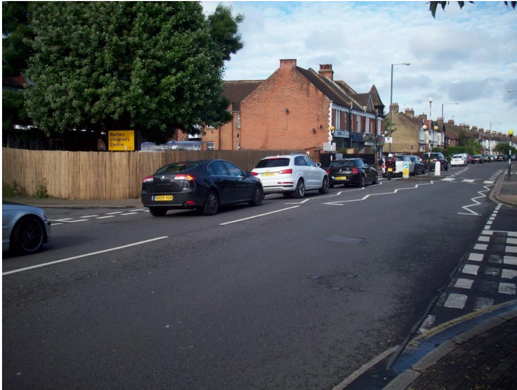
13. Same queue approaching Chalker's Corner past Children's Centre