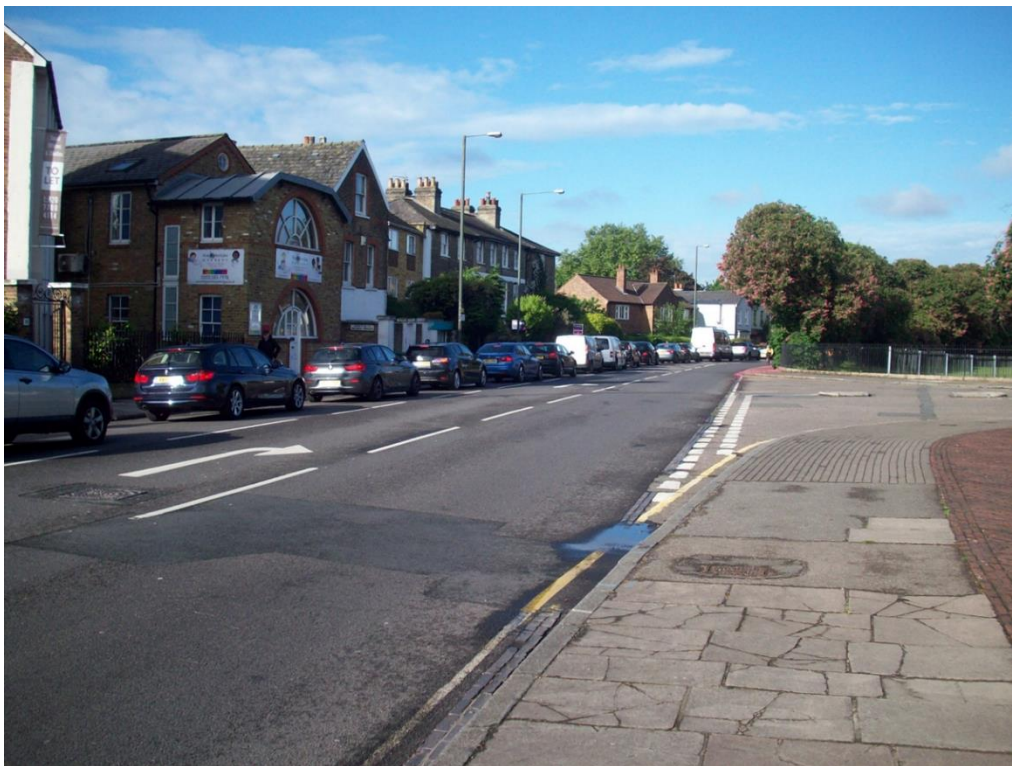
12. Same queue approaching Chalkers Corner outside entrance to Brewery (to become entrance to proposed secondary school)