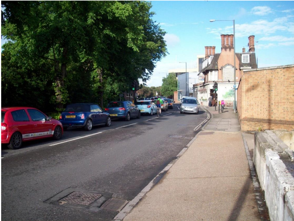
11. Same queue in Lower Richmond Road approaching Chalkers Corner past the Brewery