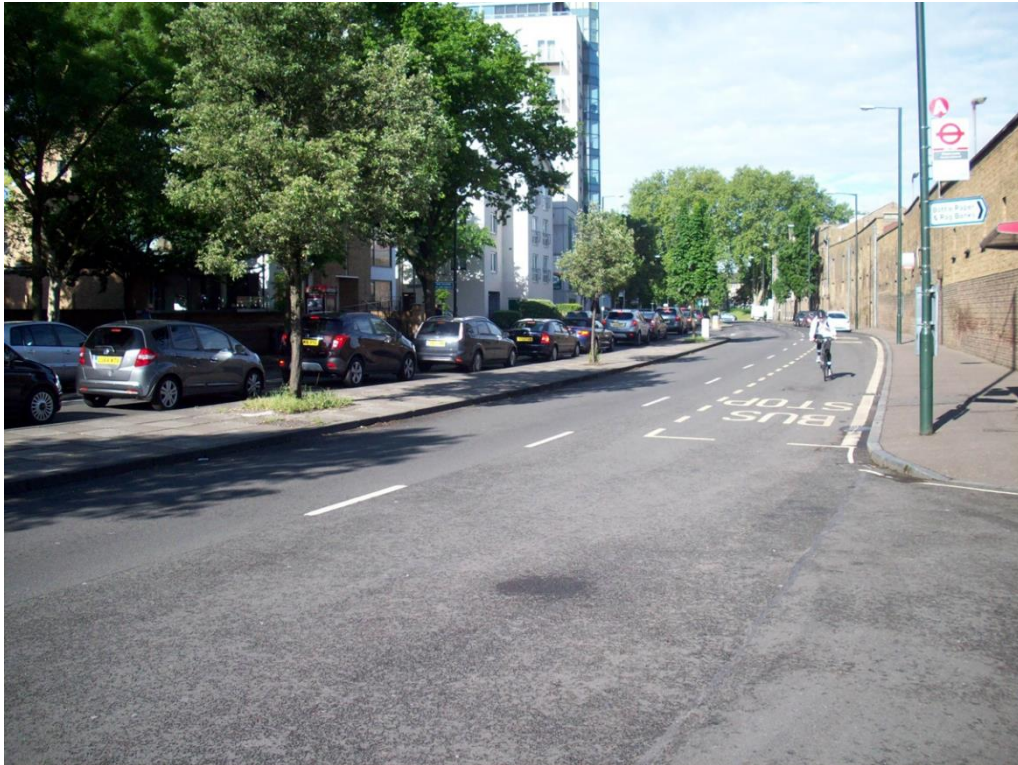
9. Mortlake High Street with queue approaching Mortlake roundabout