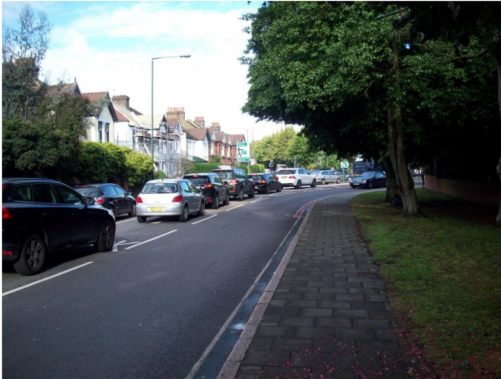
15. Same queue approaching Chalker's Corner past Chertsey Court