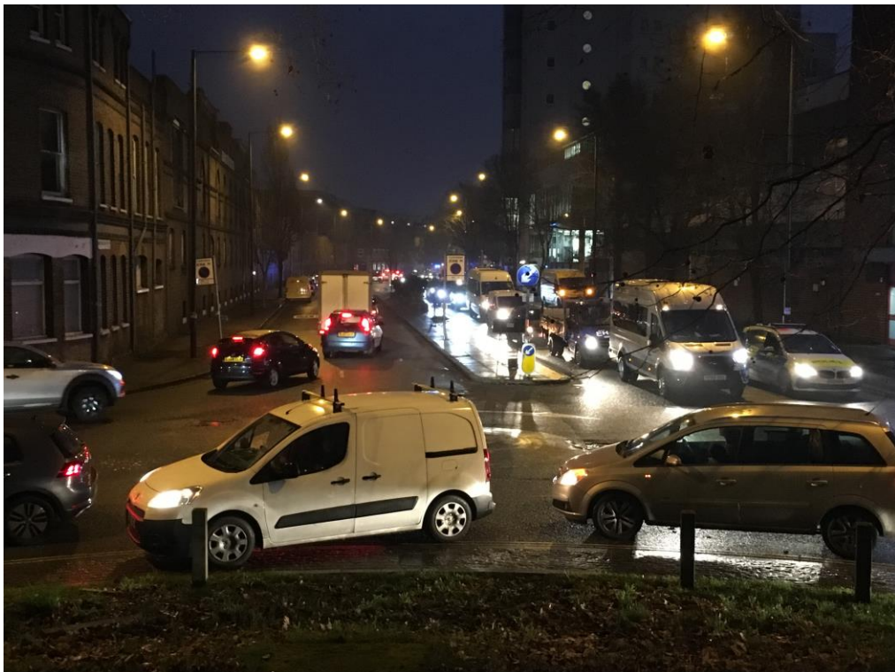
Same view in the evening