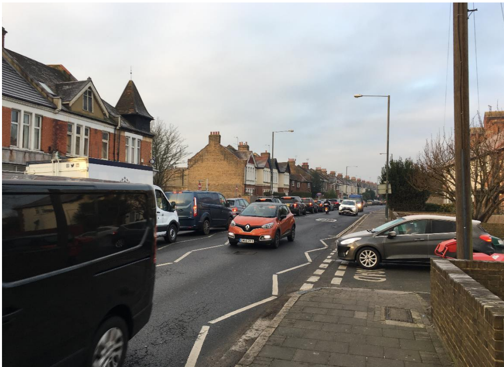
14. Same queue approaching Chalkers Corner – car having difficulty in joining queue from Watney Road