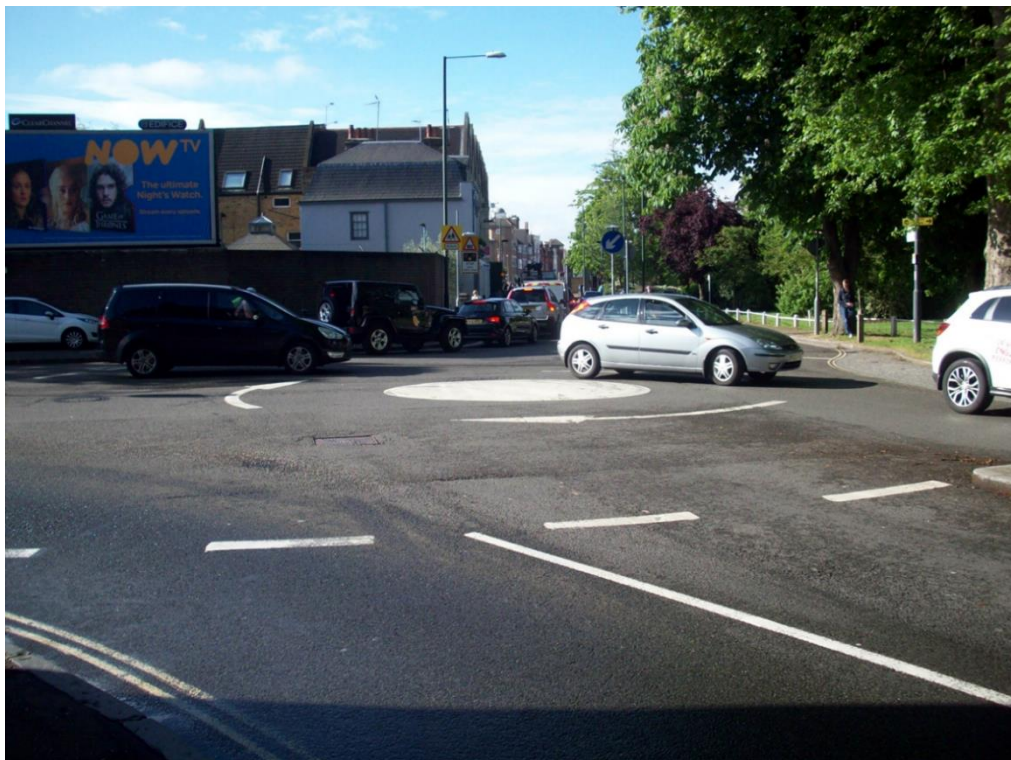
7. Mortlake roundabout with queue approaching crossing along Sheen Lane