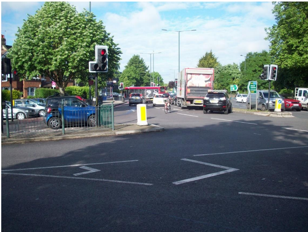
16. Chalker's Corner – note tight space for traffic turning right towards Kew