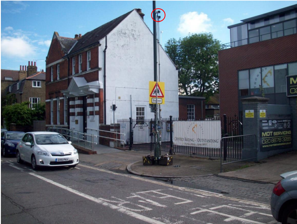
4. Thomson House School from level crossing – note cameras