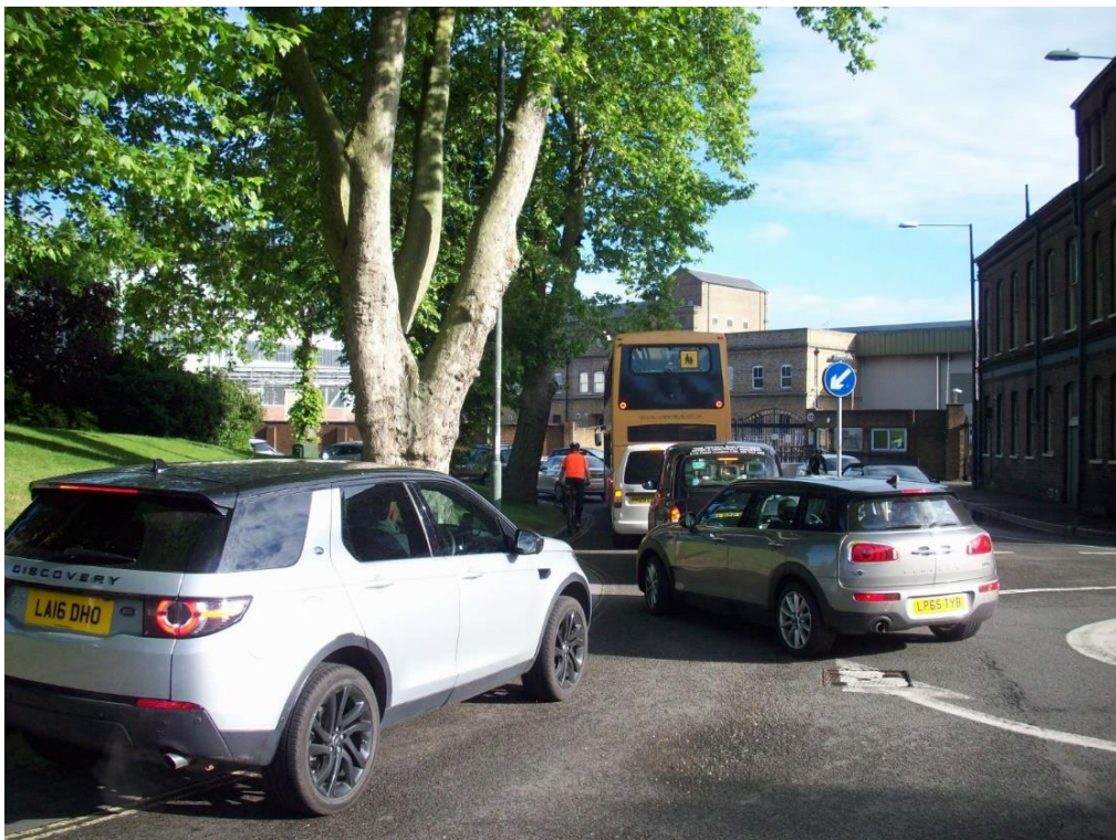
10. Mortlake roundabout with queue into Lower Richmond Road approaching Chalker's Corner