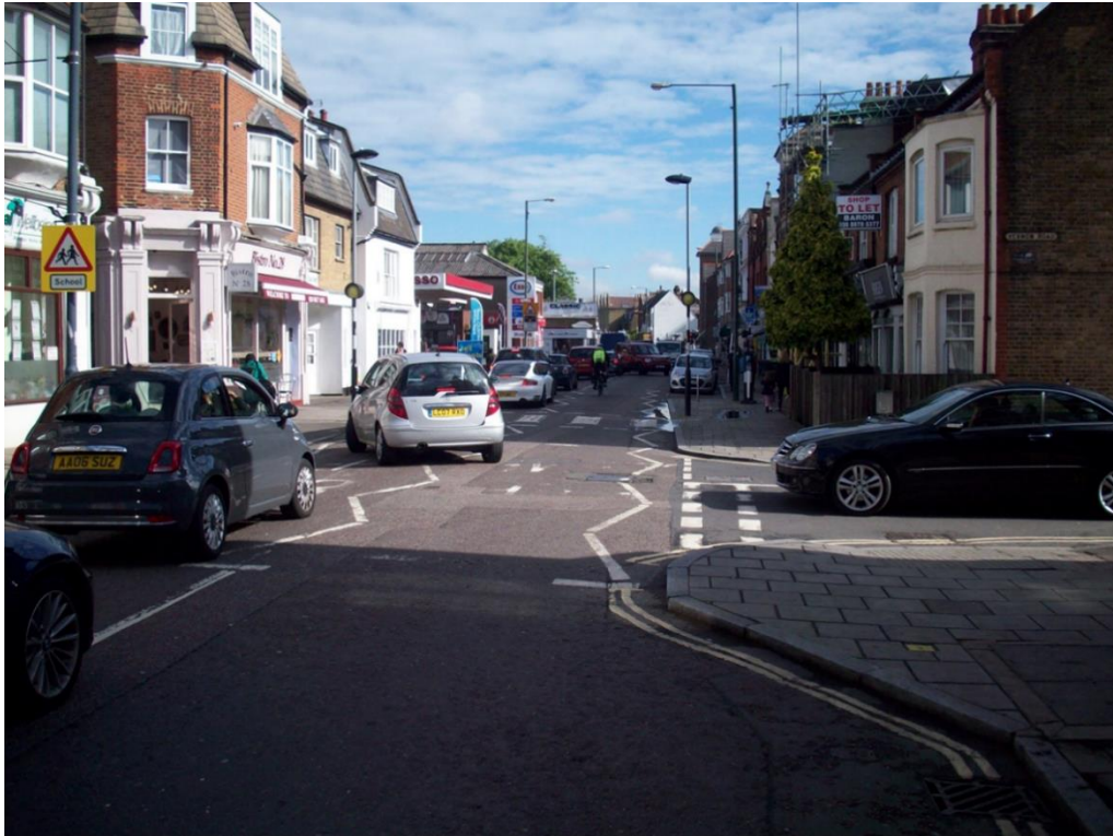
2. Same queue towards crossing – traffic in Vernon Road has difficulty in joining