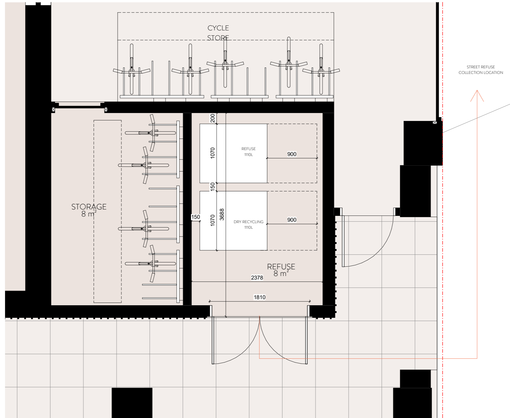
1 PROPOSED GROUND FLOOR REFUSE STORE PLAN