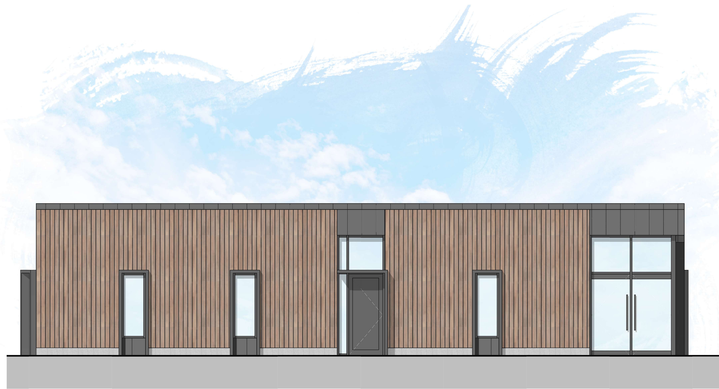
North East Elevation 1 : 50

General notes: do not scale from the drawing. all dimensions shall be checked on site prior to commencing works. all works shall conform to the current edition of the building regulations and other relevant statutory requirements. all materials and workmanship shall conform with the relevant british standard specifications and codes of practice. this drawing is the copyright of gdm architects and shall not be copied or reproduced without permission. this drawing shall be read in conjunction with gdm architect's health and safety risk assessments and all works shall be carried out in a safe manner, by competent persons. drawing produced by gdm architects ltd trading as gdm architects. Subject to site survey and I.A. approvals. © gdm architects ltd trading as gdm architects