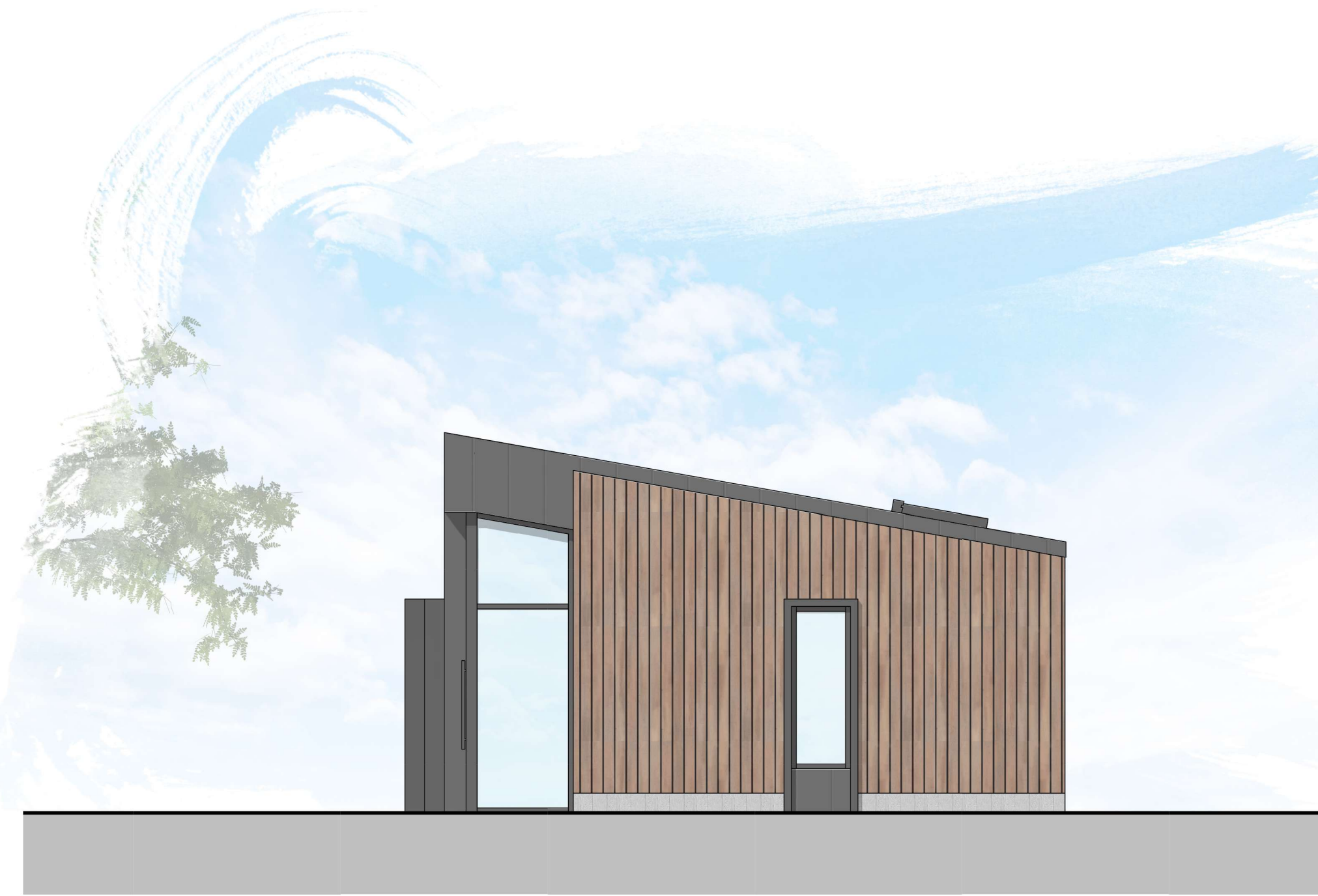
North West Elevation 1 : 50