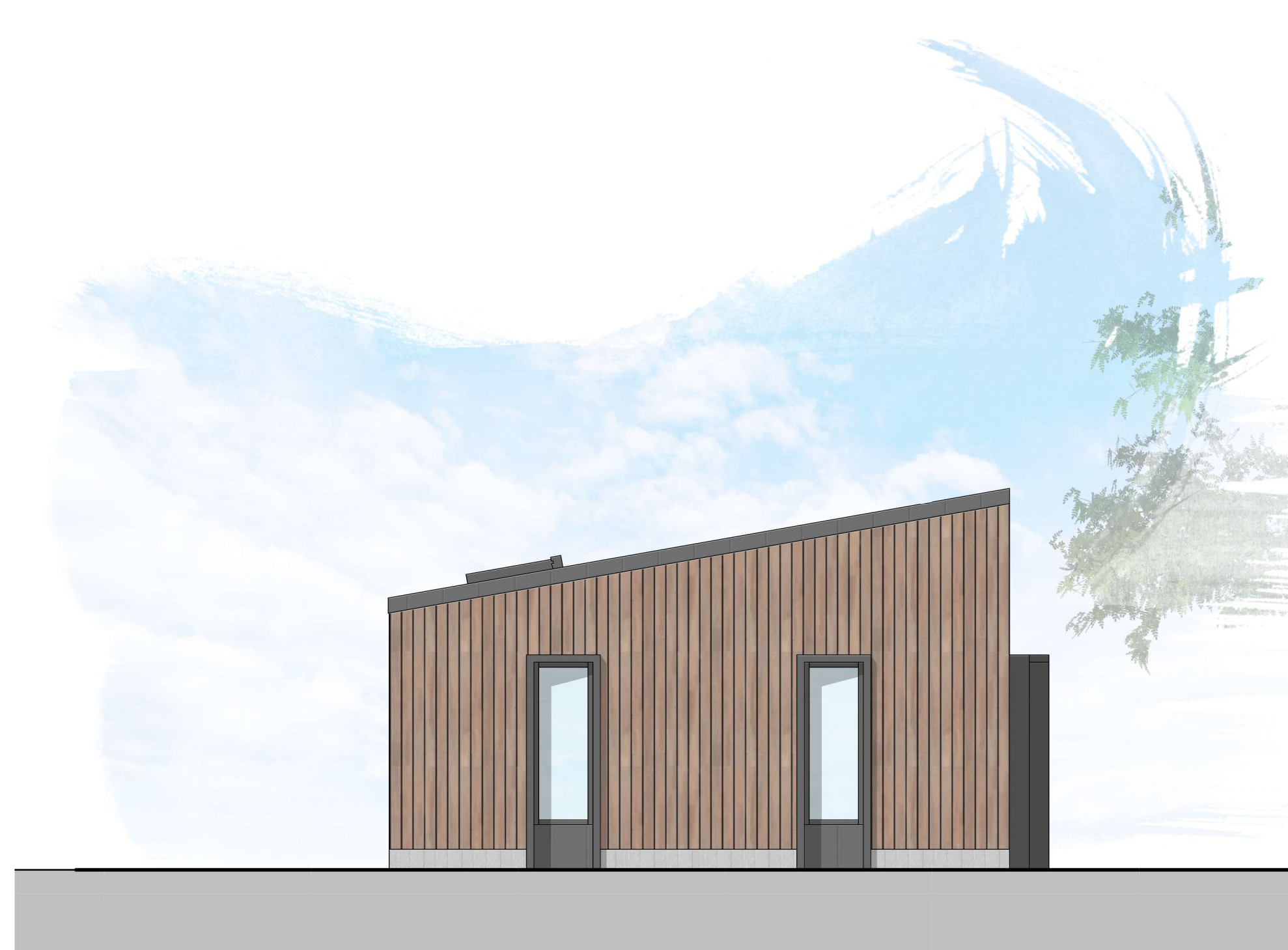
South East Elevation 1 : 50