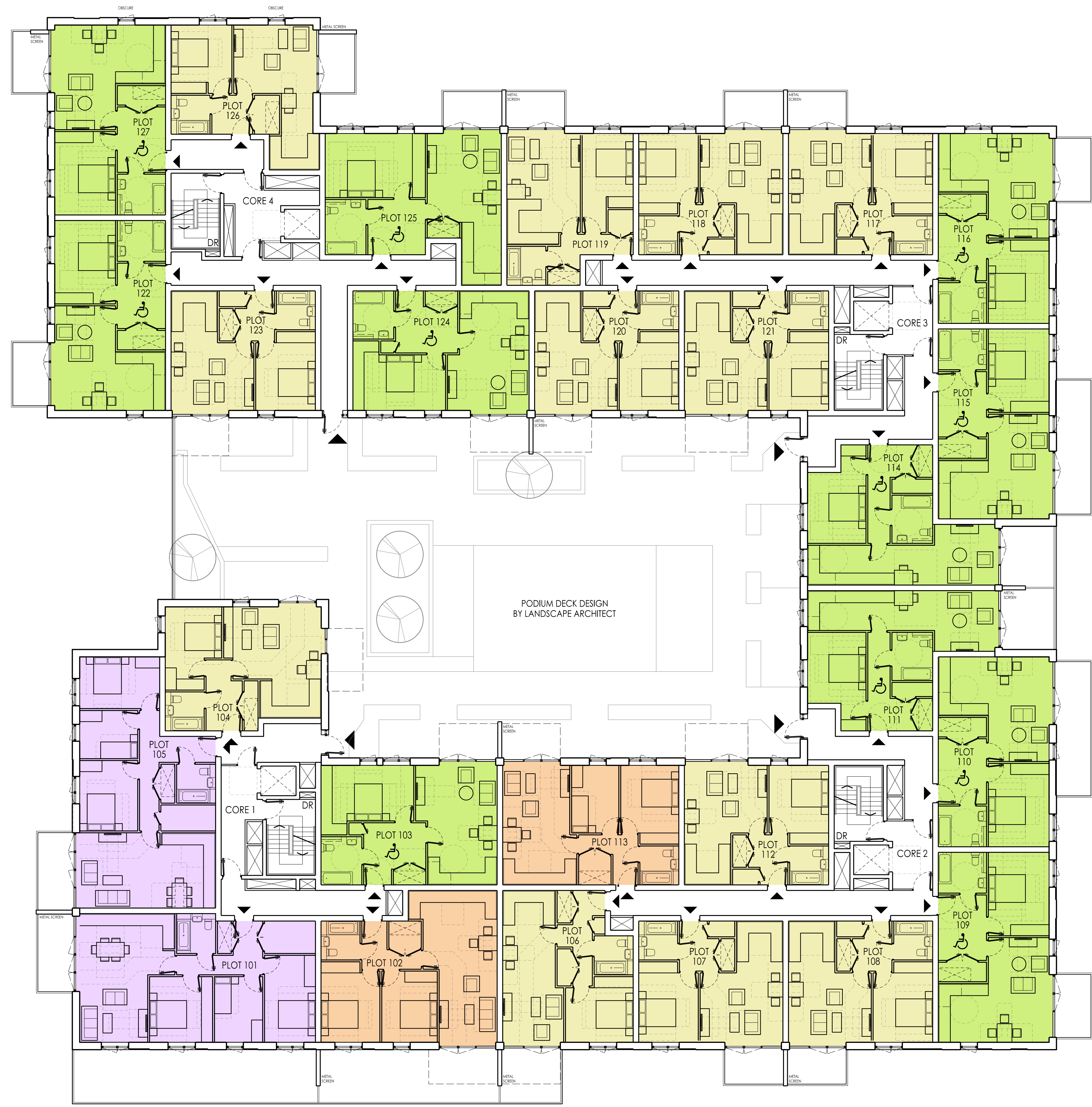
BLOCK B1: FIRST FLOOR PLAN