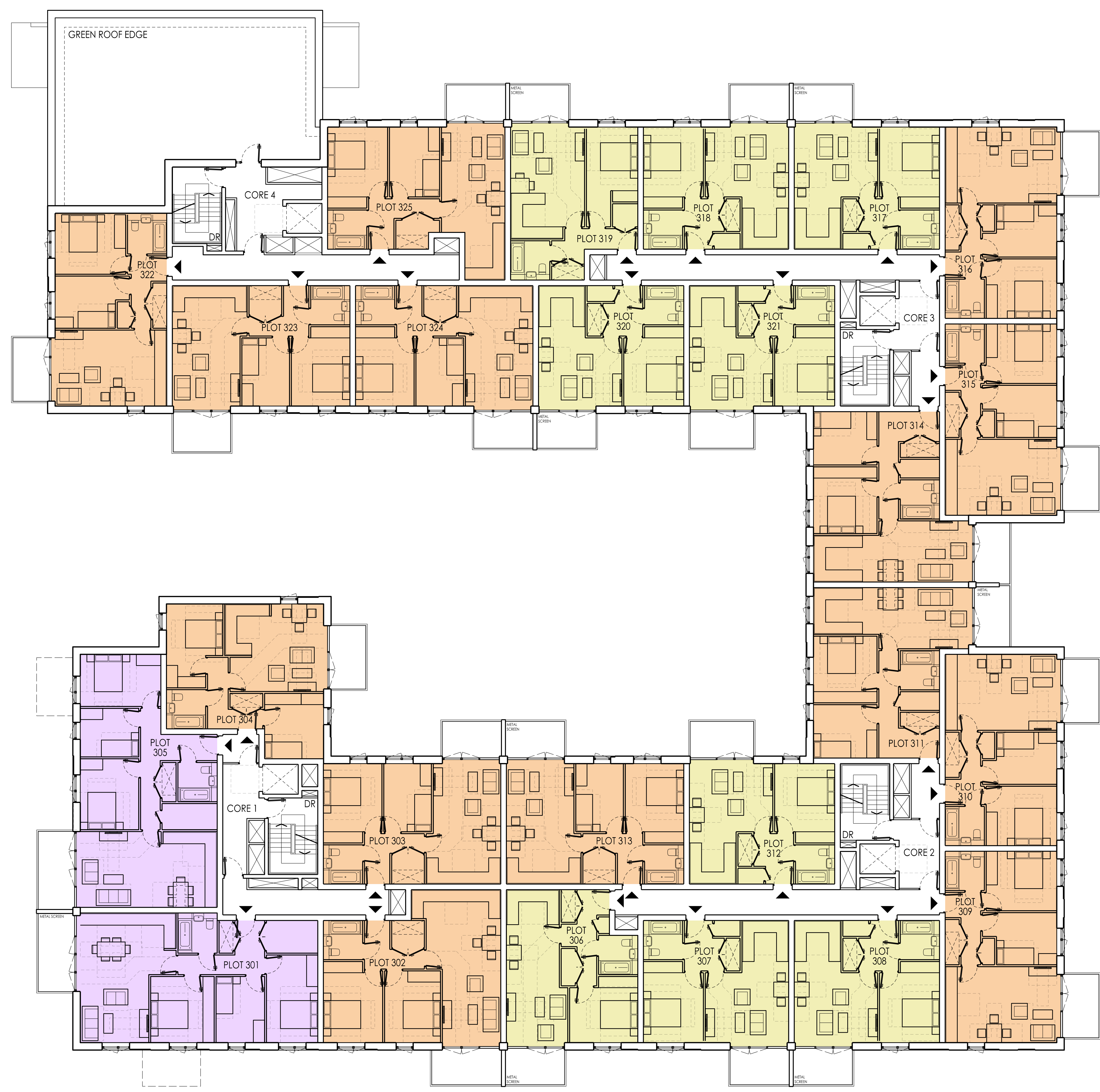
BLOCK B1: THIRD FLOOR PLAN