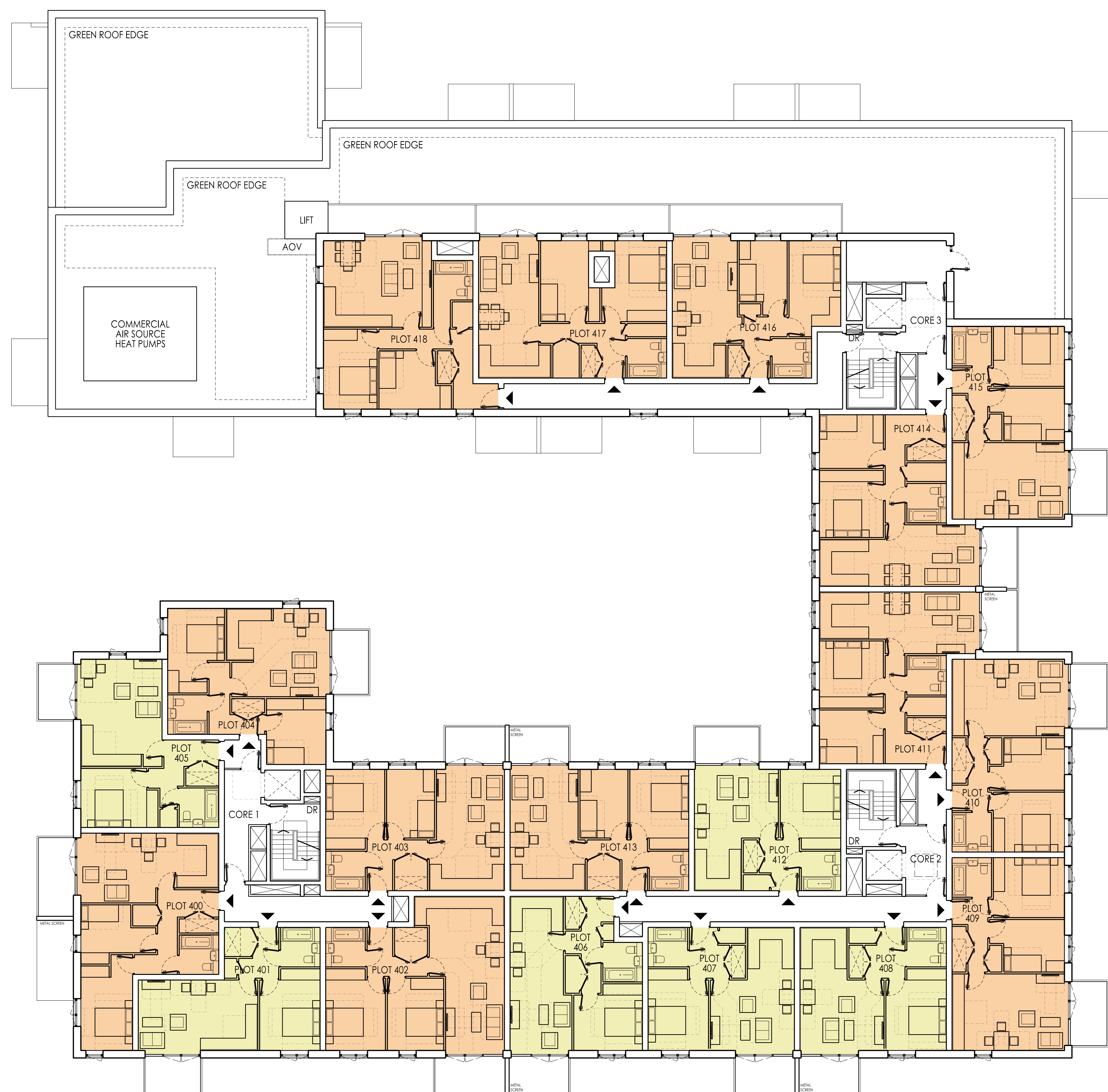
BLOCK B1: FOURTH FLOOR PLAN