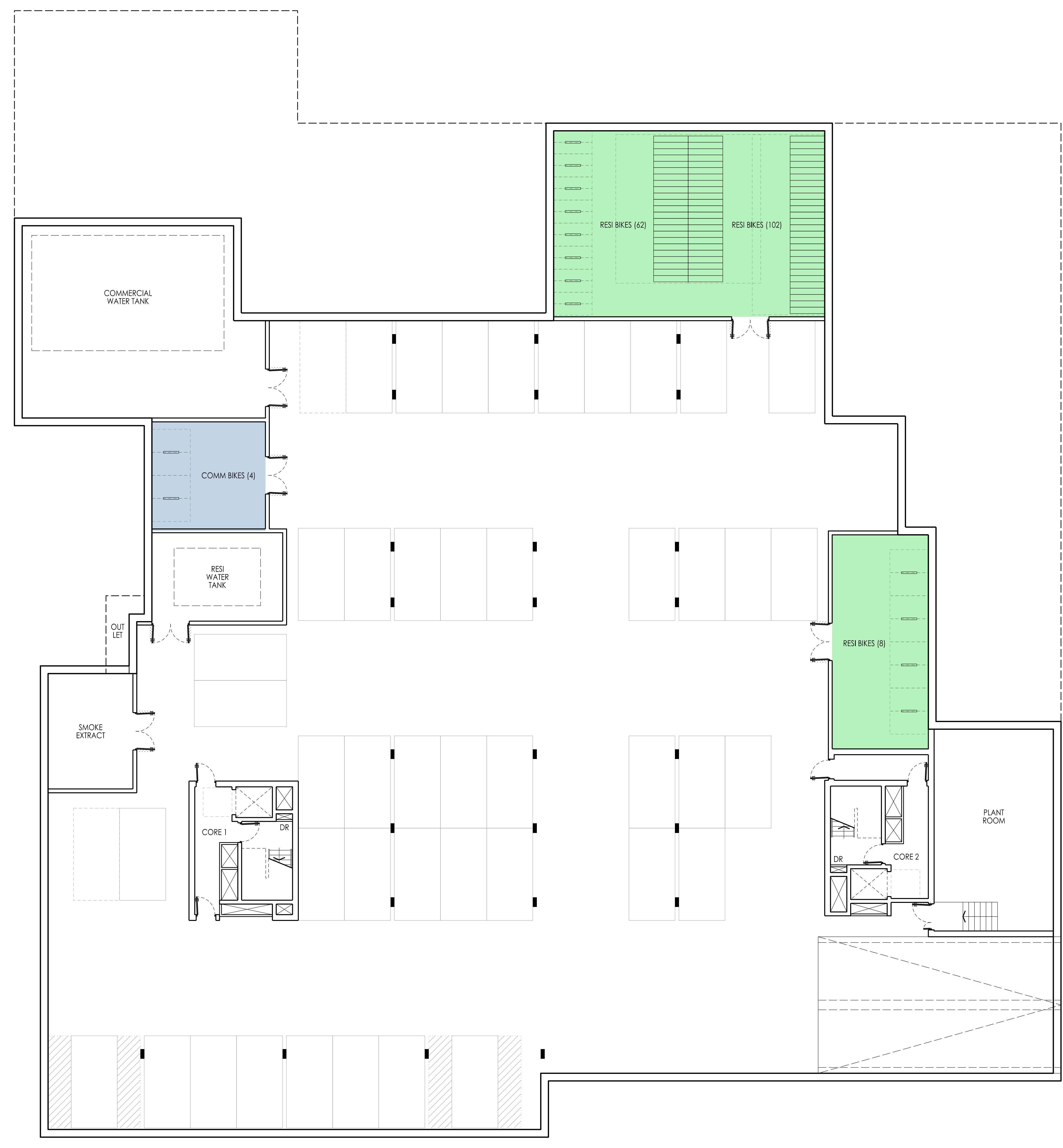
BLOCK B1: BASEMENT PLAN

RESIDENTIAL CYCLE PARKING COMMERCIAL BIKE STORES