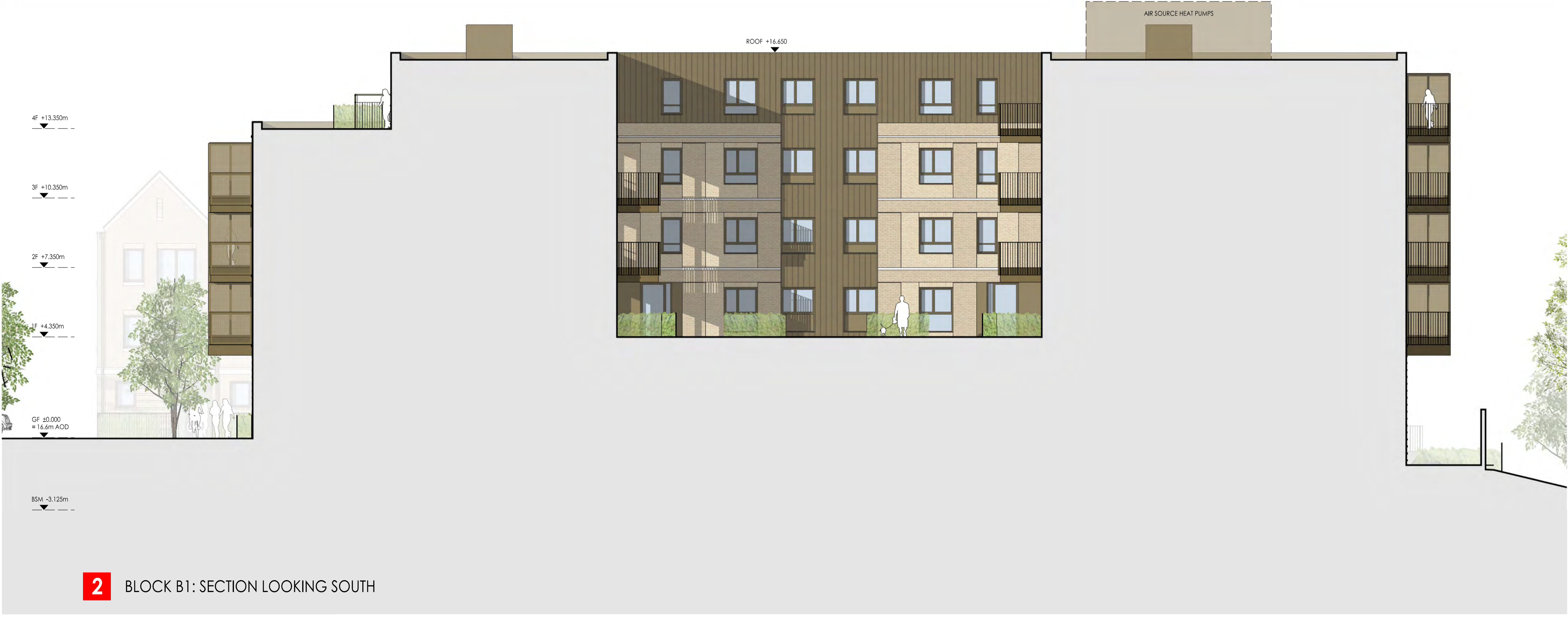
2 BLOCK B1: SECTION LOOKING SOUTH