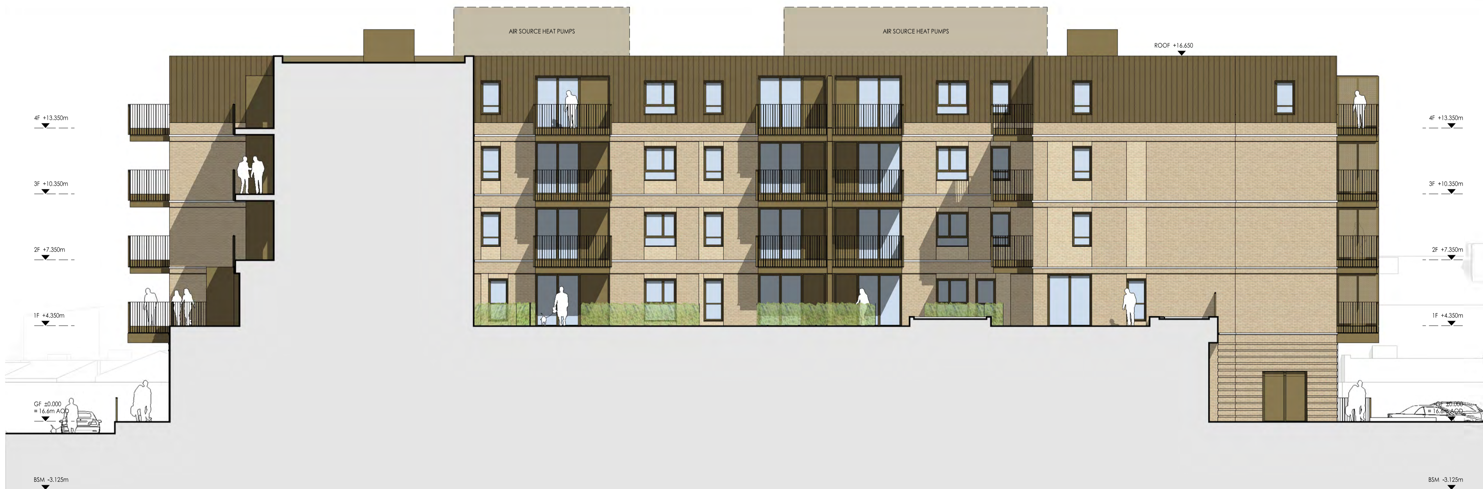
1 BLOCK B1: EAST ELEVATION