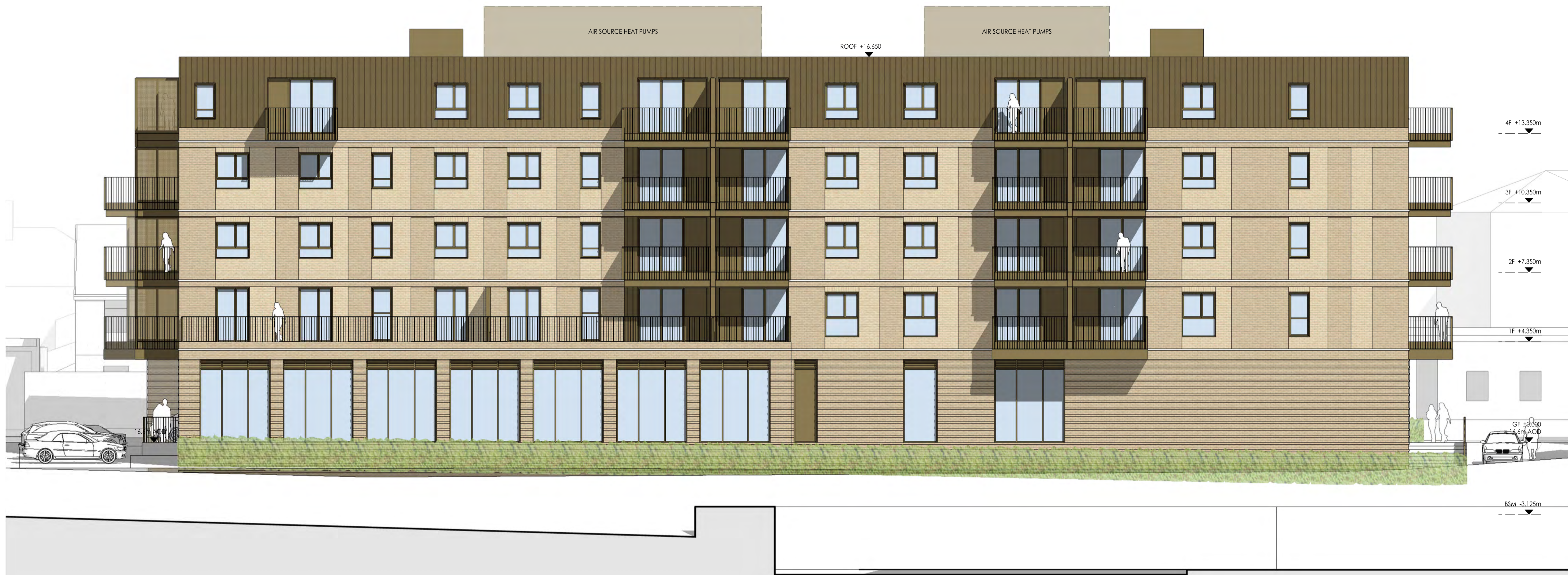
1 BLOCK B1: WEST ELEVATION