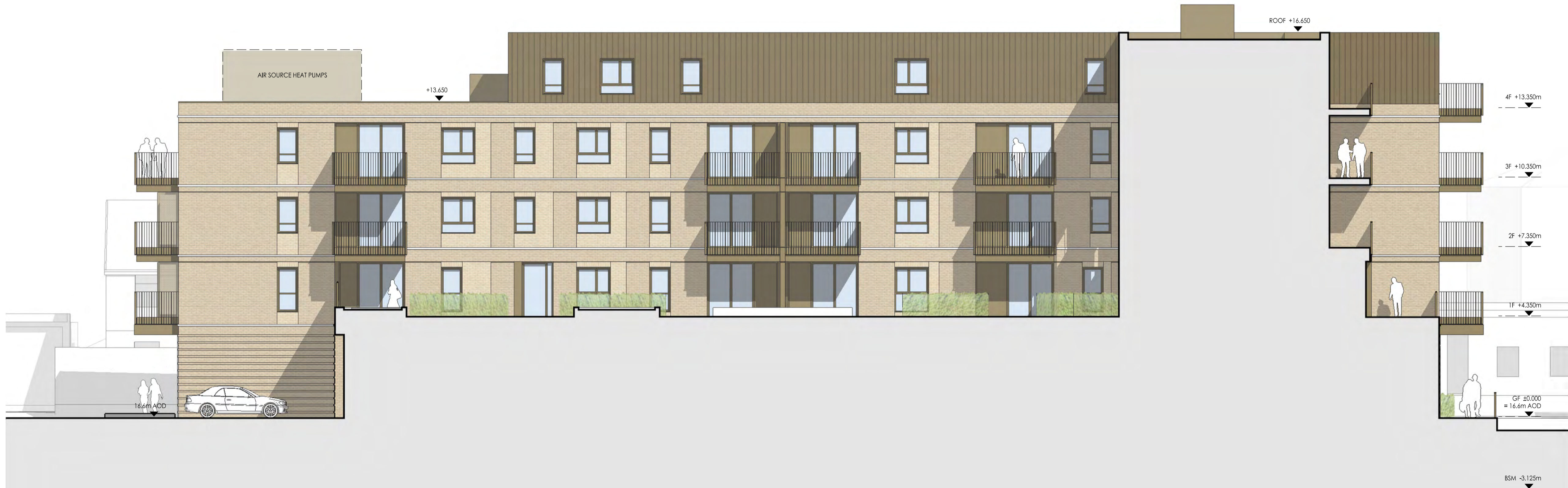
2 BLOCK B1: SECTION LOOKING EAST