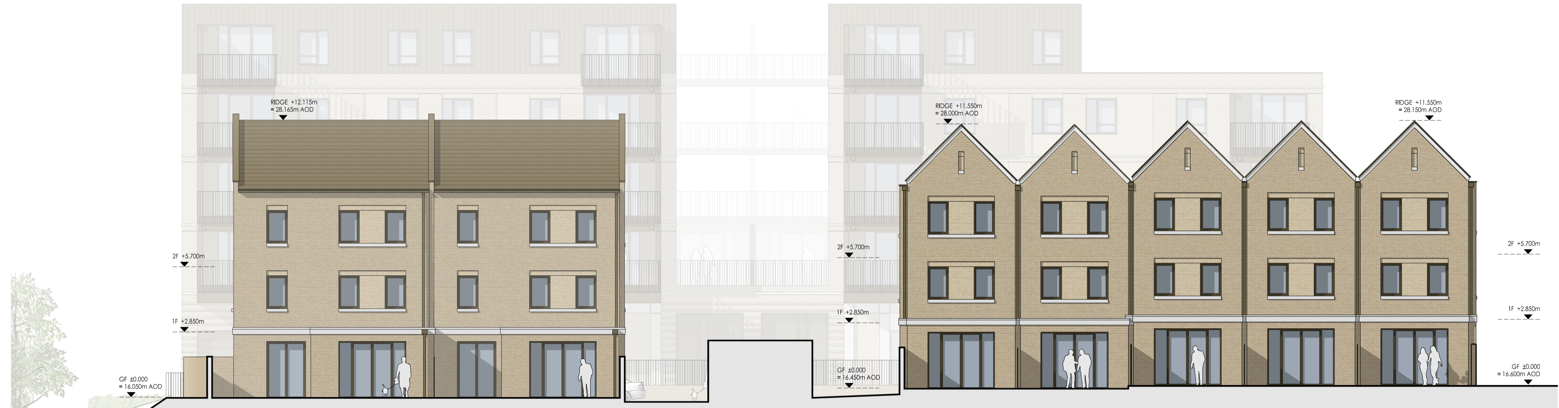
2 SOUTHERN TERRACE: SOUTH ELEVATION