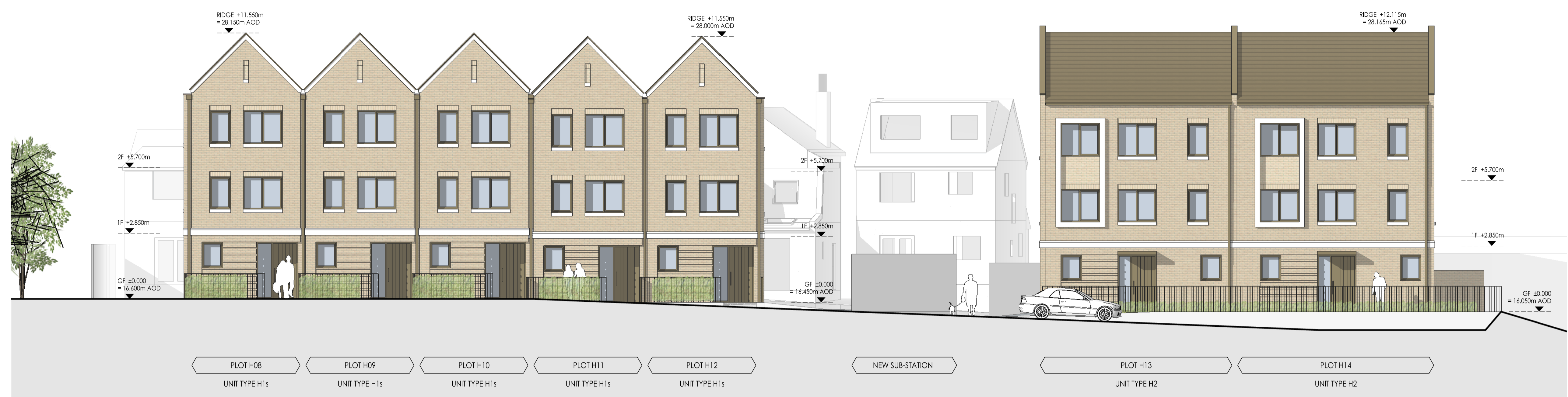
1 SOUTHERN TERRACE: NORTH ELEVATION