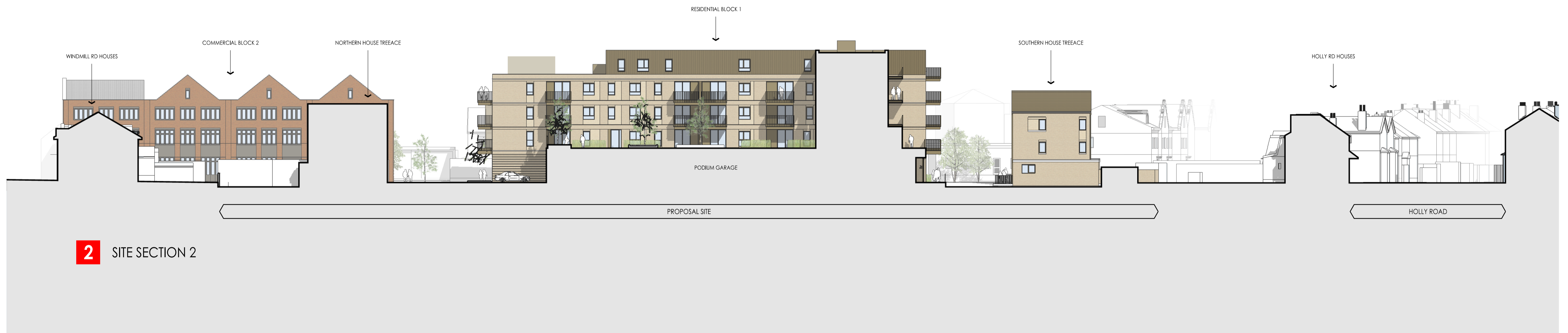
2 SITE SECTION 2