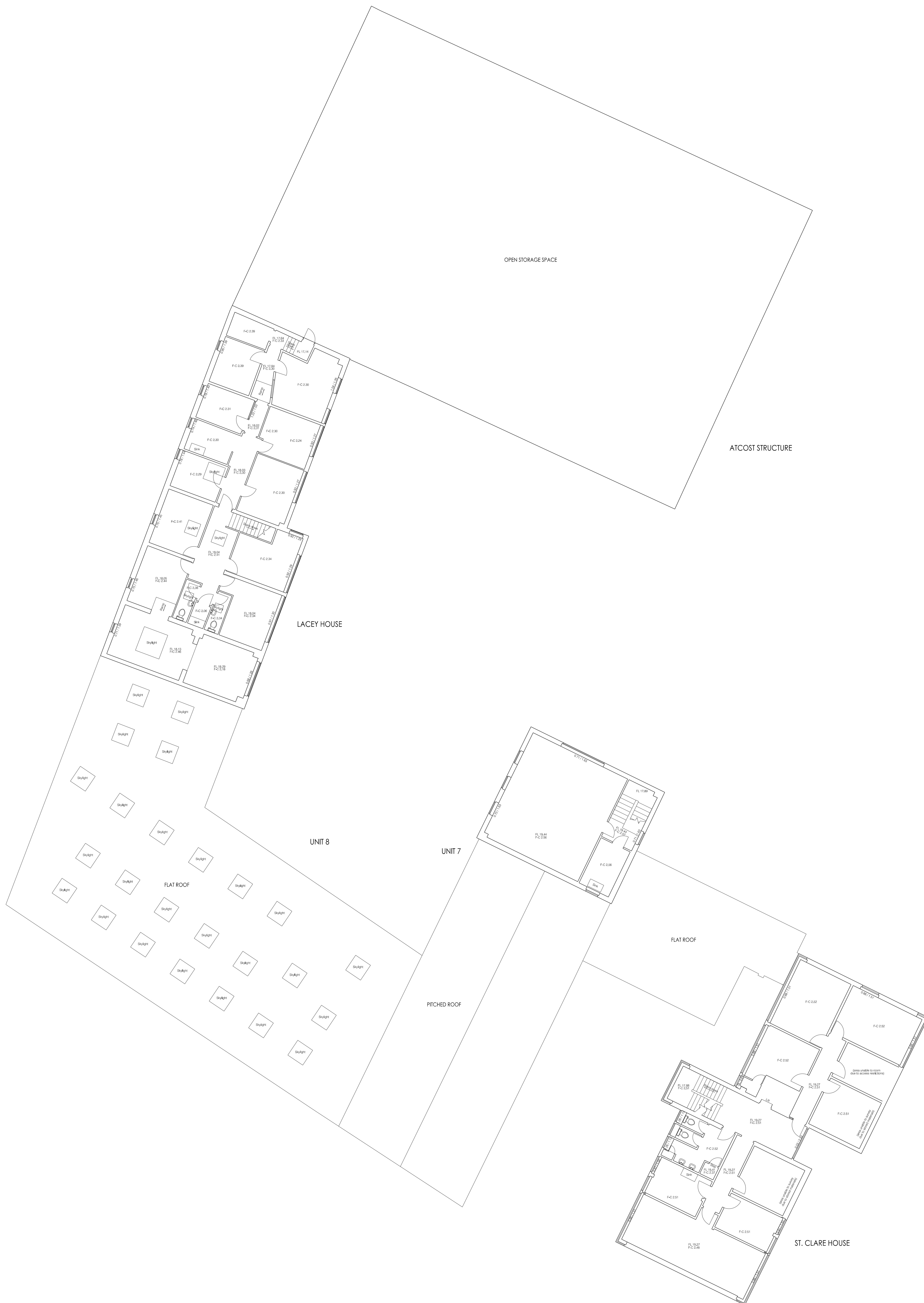
EXISTING FIRST FLOOR PLAN (SOUTH SIDE)