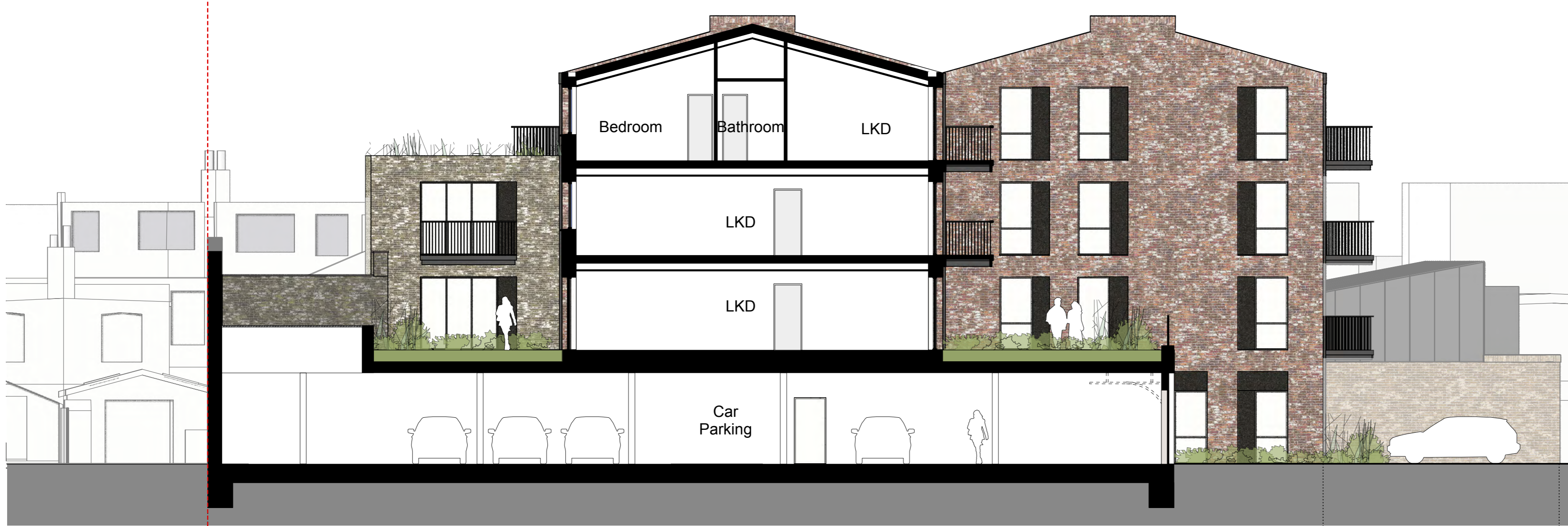
1 Section A Scale: 1:100