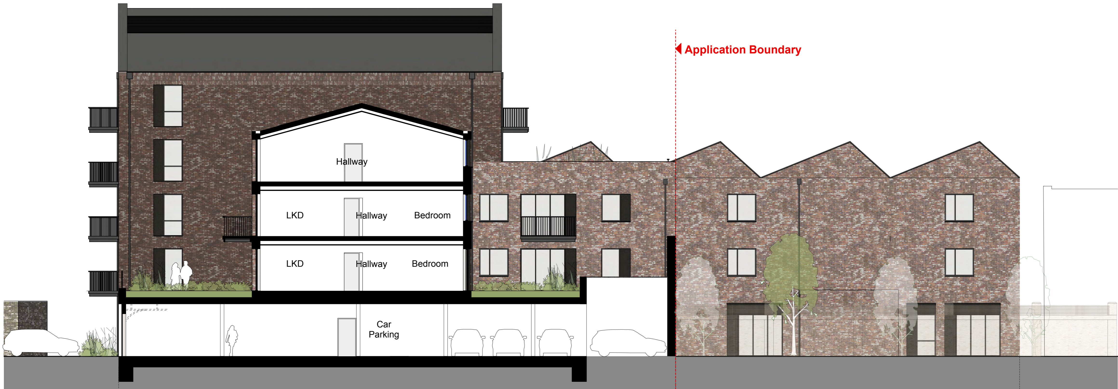
2 Section B Scale: 1:100