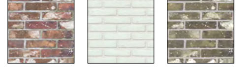
Other brick tones for this house type