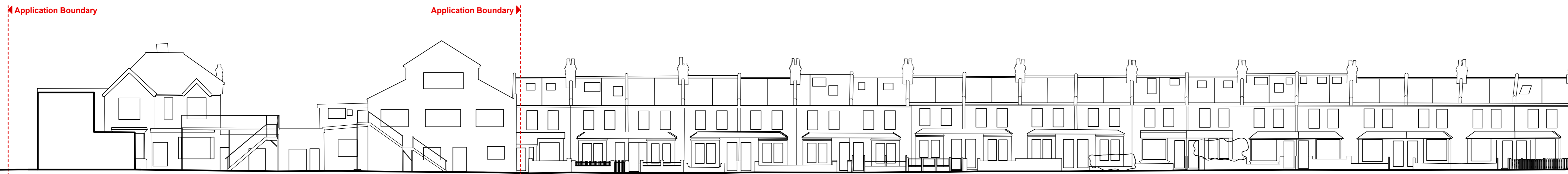
4 Elevation/Section 4 1:200

NO.S 53 - 71 EDWIN ROAD EDWIN ROAD RESIDENTS PARKING PHOENIX TURNER AUTOMOTIVE YOUNGS NO.S 88 - 98 COLNE ROAD WHETTON AND GROSCH SCULPTURE