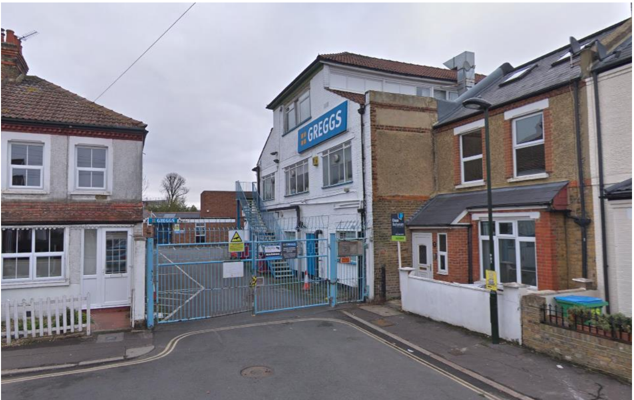
Gould Road entrance