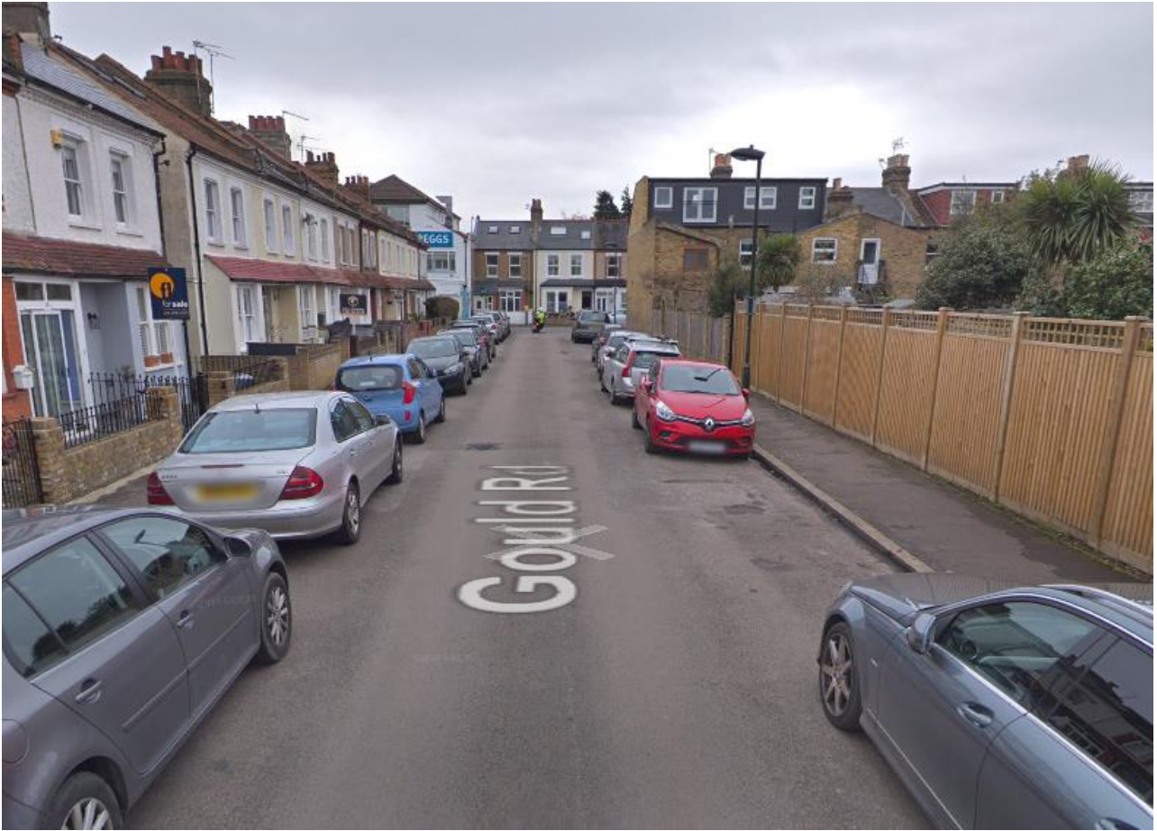
Gould Road towards Greggs