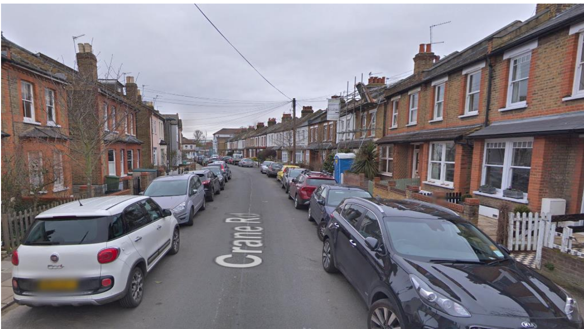
Crane Road towards Greggs

The premises have been out of commission as food production for some 5 years following the decision, as noted below, by the owners to relocate to modern facilities away from an anomalous setting in a residential side-street. Whilst there is vehicular access to the site via Edwin Road and Crane Road at the confluence of a 90-degree right-hand turn with Gould Road.