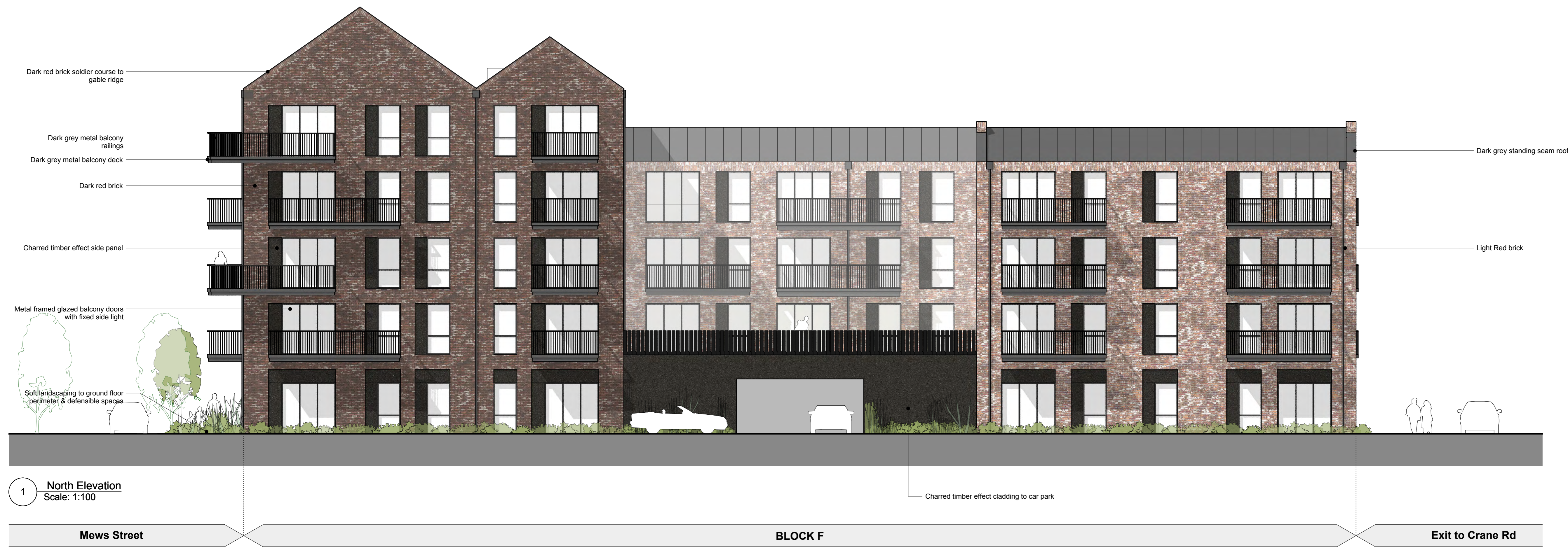
1 North Elevation Scale: 1:100