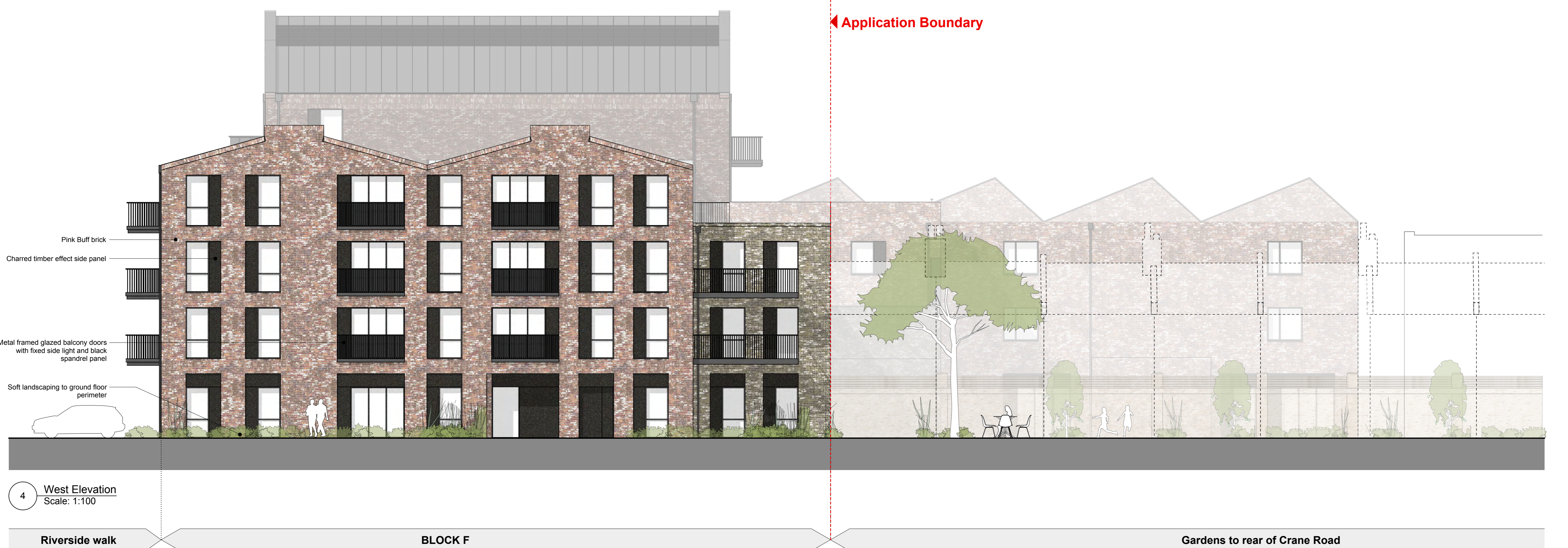
4 West Elevation Scale: 1:100