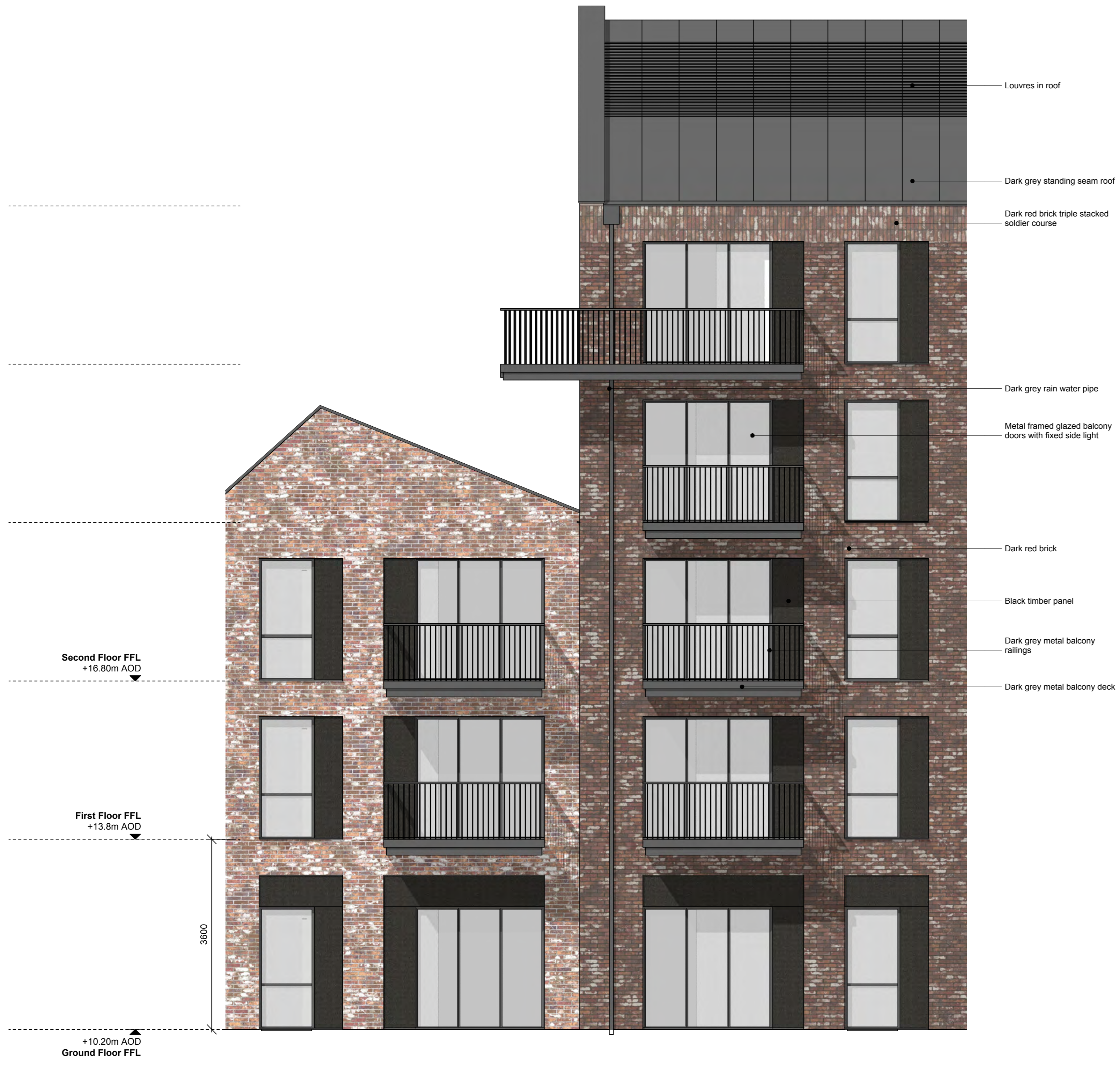
EAST ELEVATION EXTRACT

Assael Architecture Limited 123 Upper Richmond Road London SW15 2TL +44 (0)20 7736 7744 info@assael.co.uk www.assael.co.uk