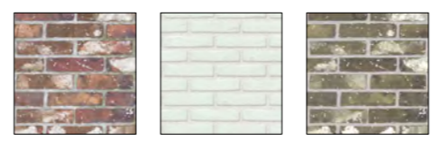
Other brick tones for this house type