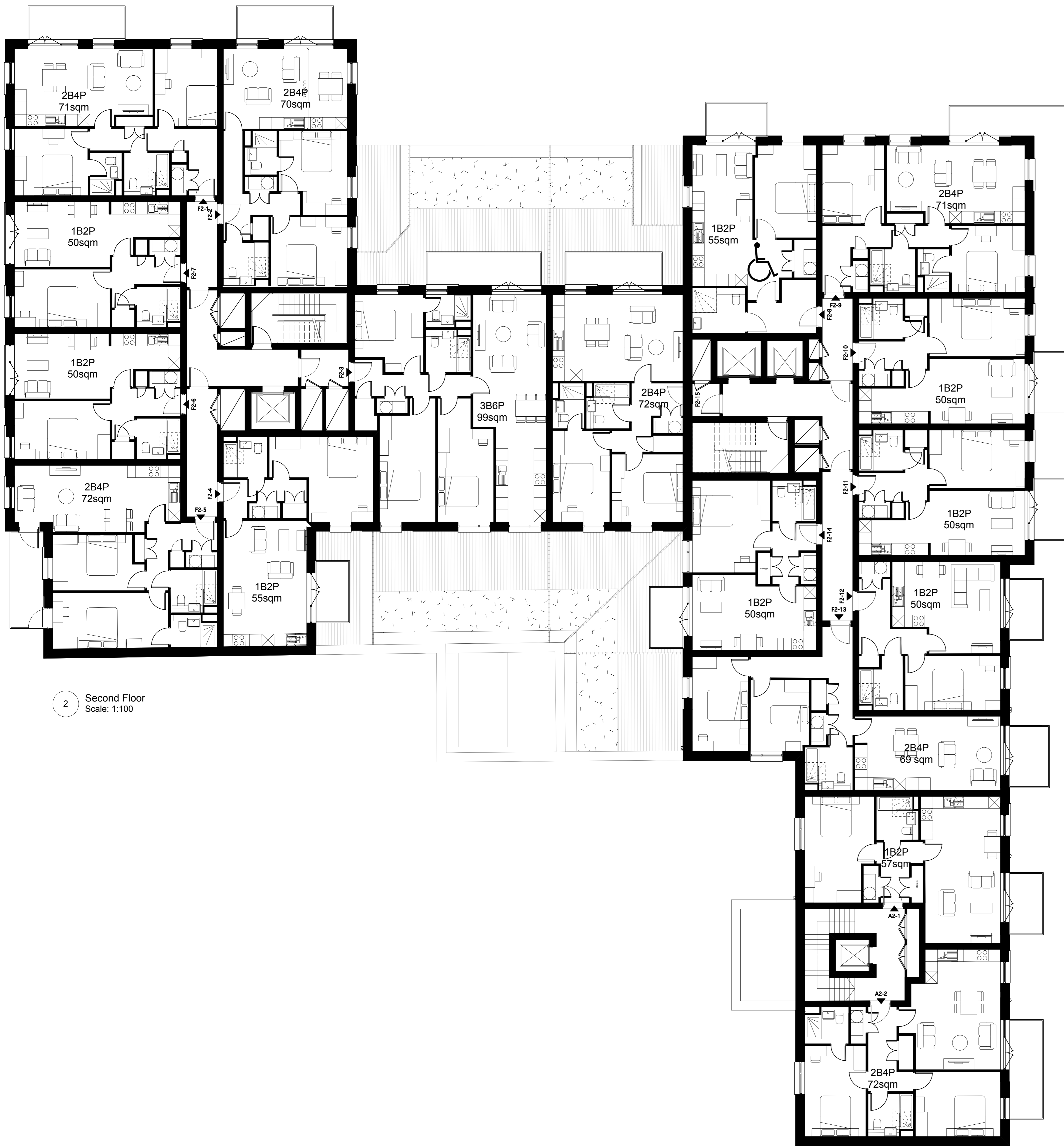
2 Second Floor Scale: 1:100