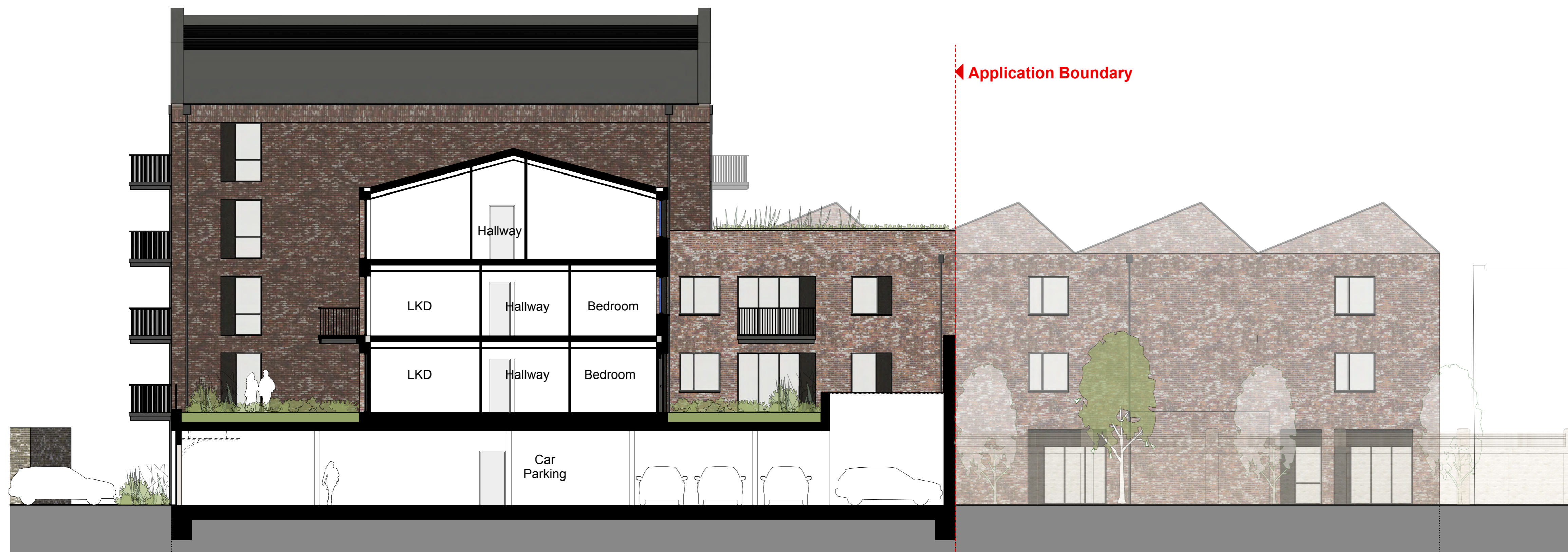
2 Section B Scale: 1:100