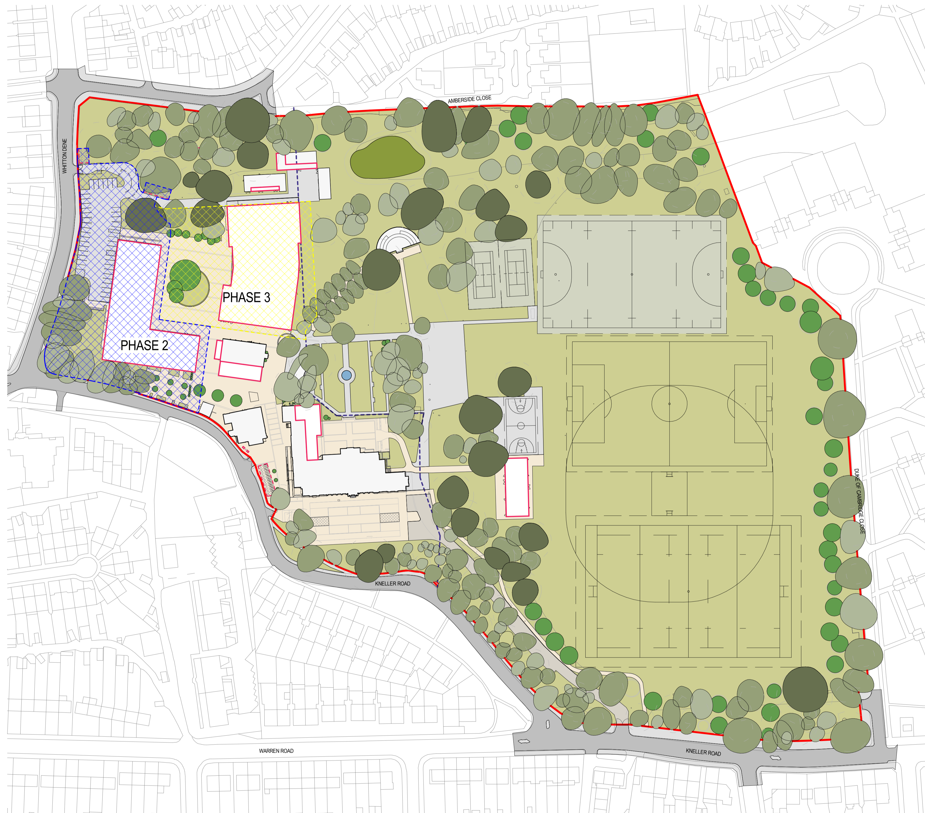
1 PROPOSED PHASING PLAN 1 : 1000