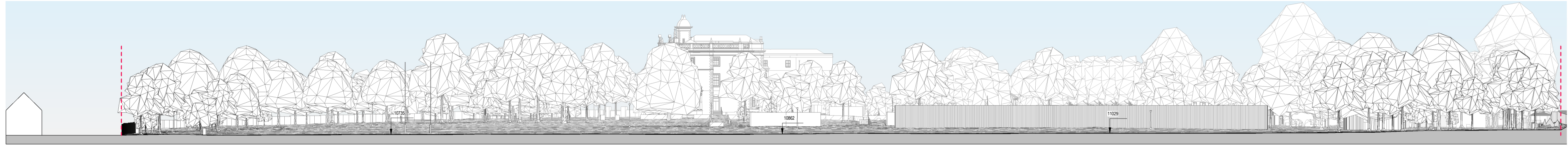
1 EXISTING SITE SECTION A 1 : 500