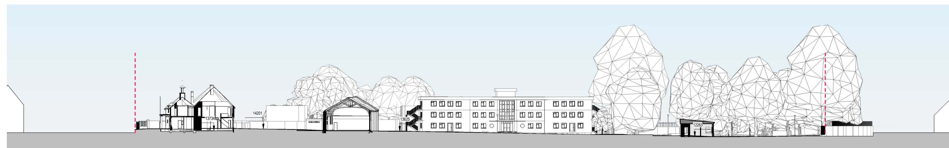
3 EXISTING SITE SECTION C 1 : 500