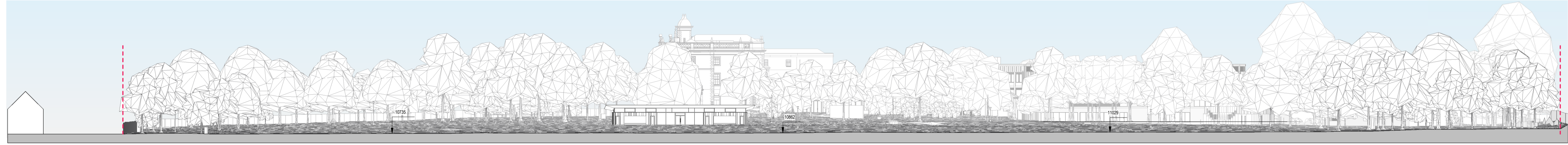
1 PROPOSED SITE SECTION A 1 : 500