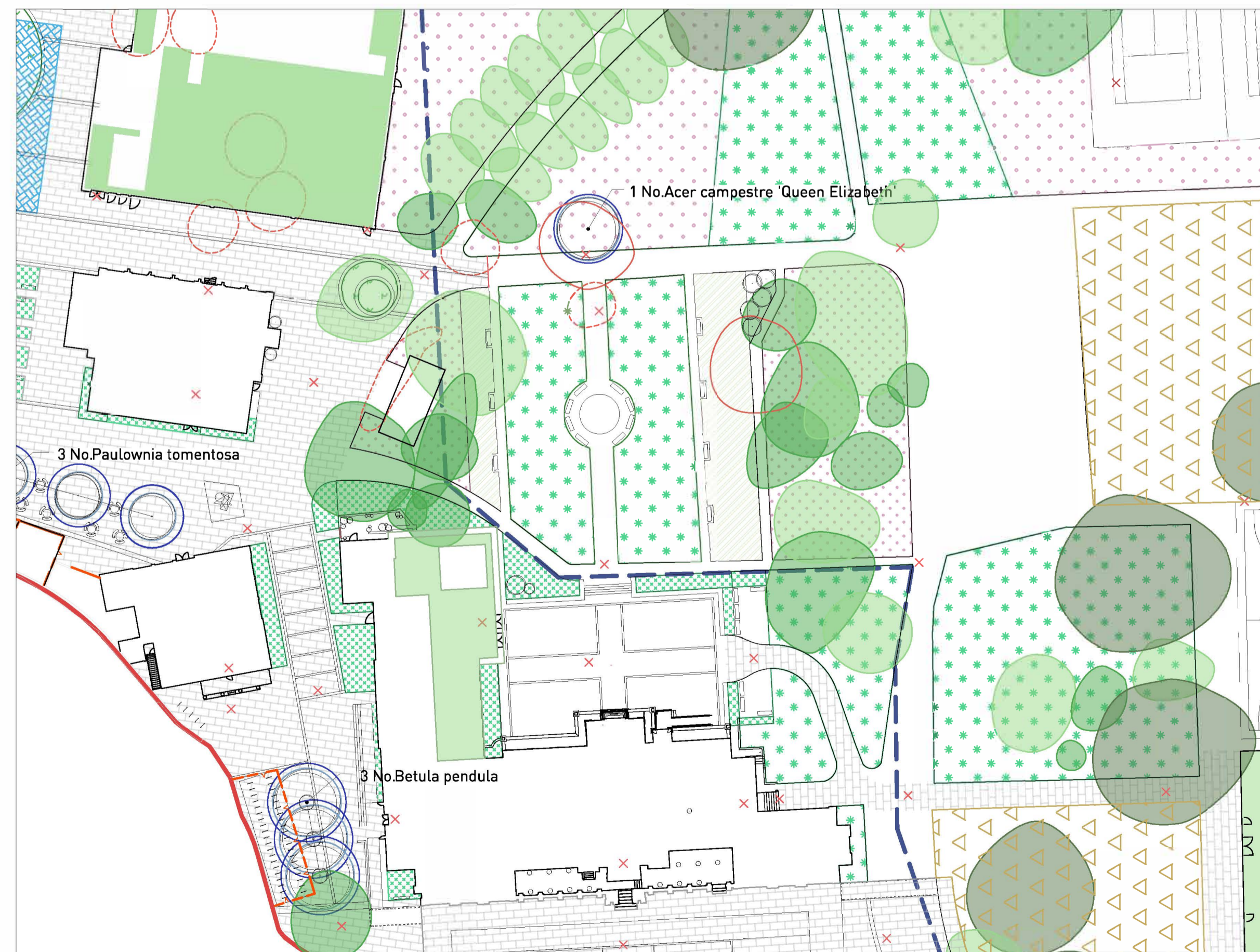
03 Terrace Gardens 1:500