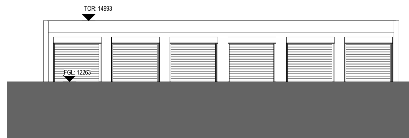
6 EXISTING BUILDING 3 WEST ELEVATION 1 : 100