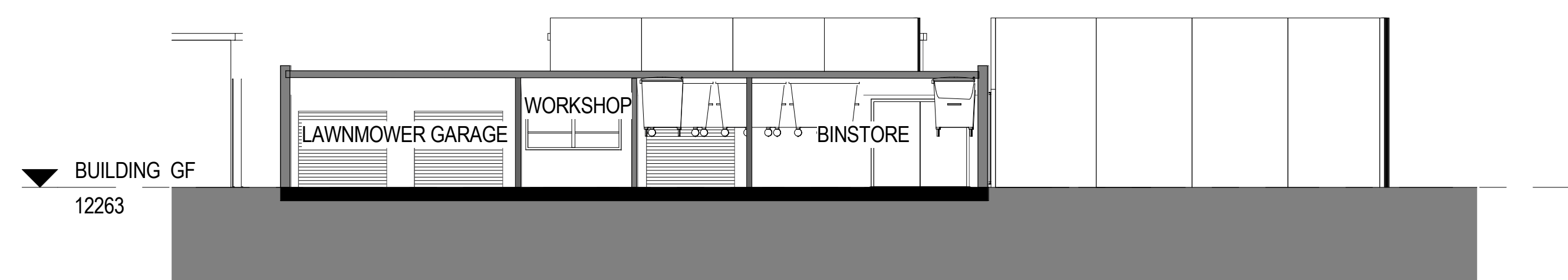
2 SECTION BB 1 : 100