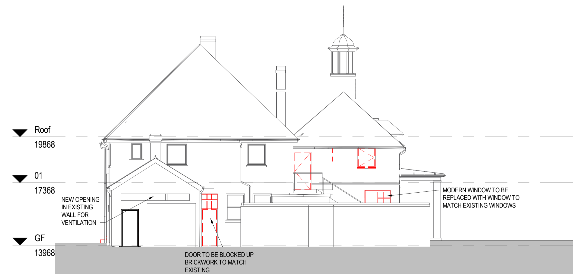
4 WEST ELEVATION - DEMOLISHED 1 : 100