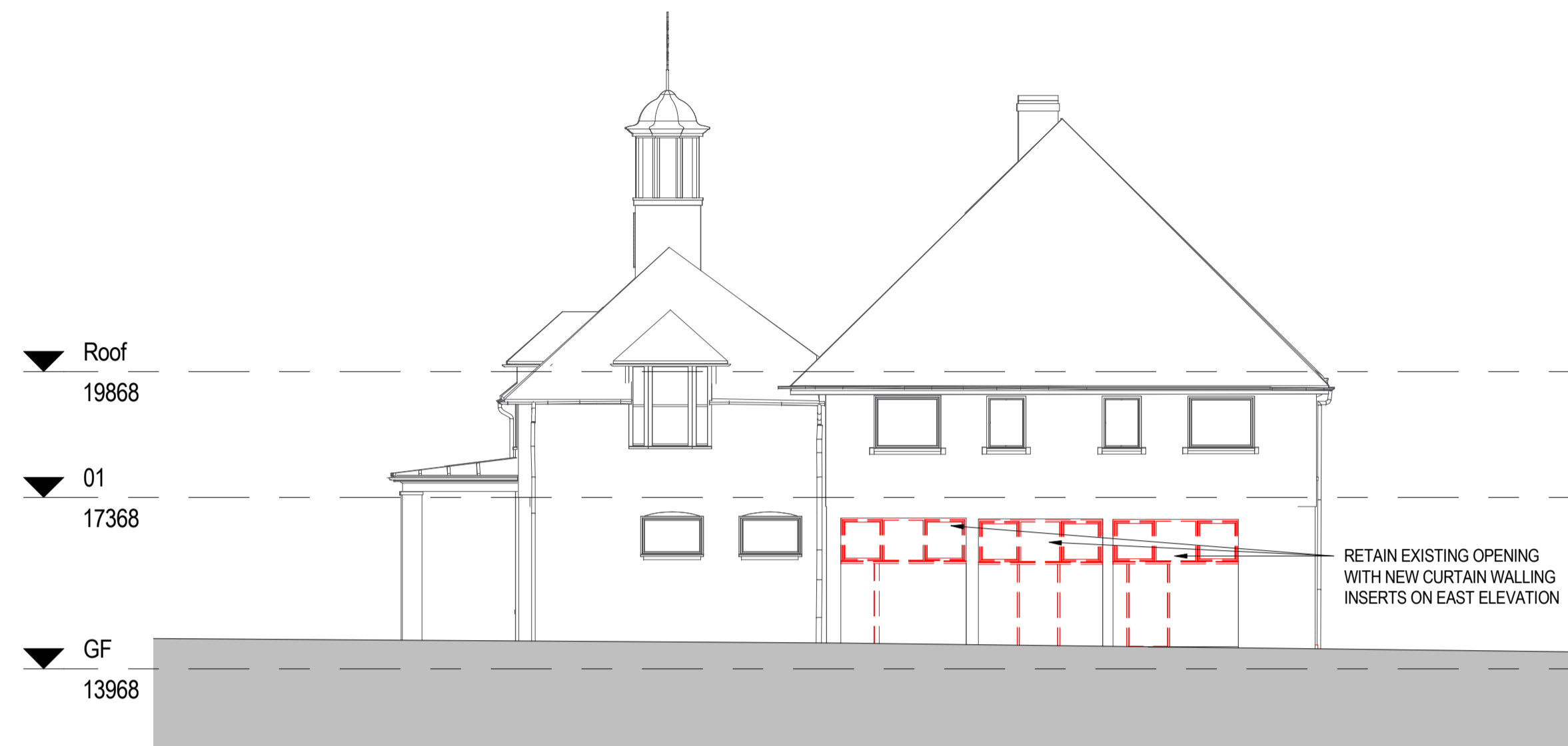
2 EAST ELEVATION - DEMOLISHED 1 : 100