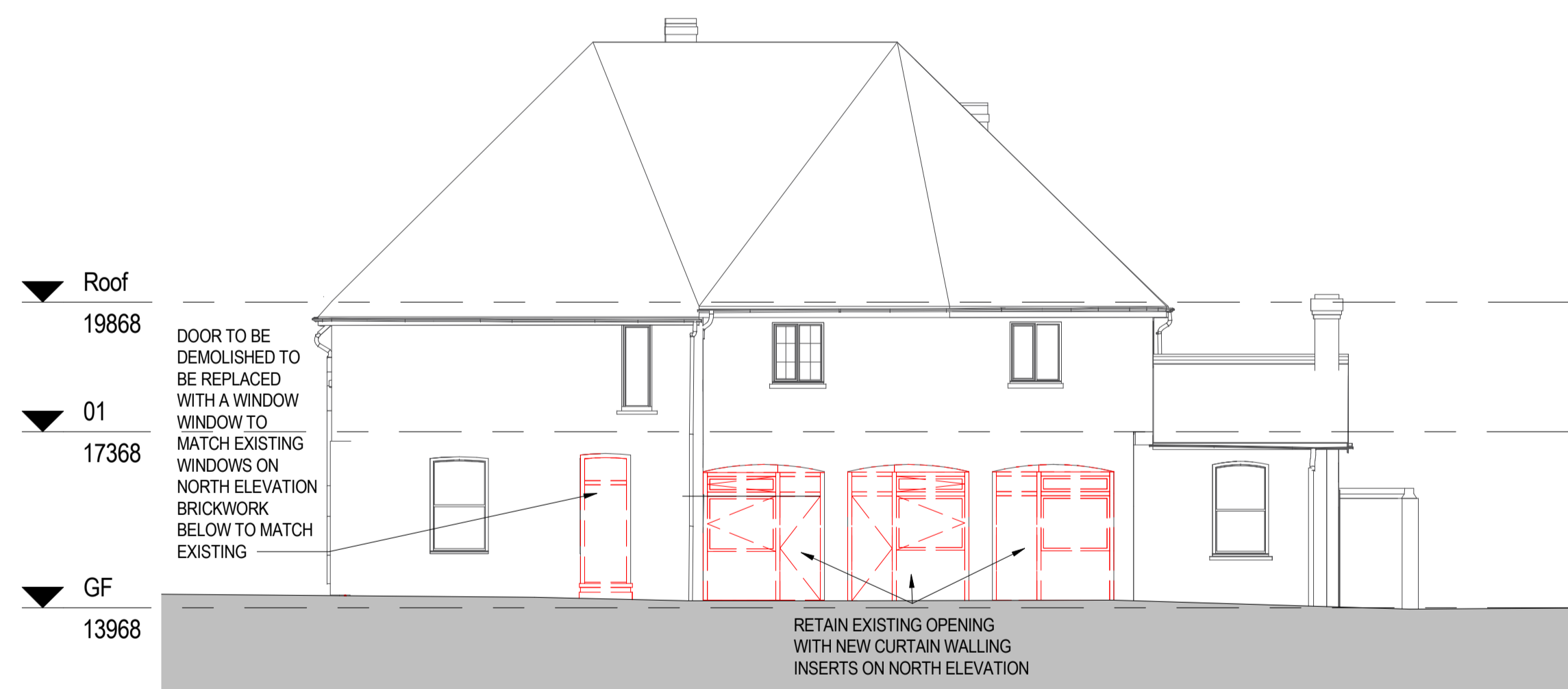
3 NORTH ELEVATION - DEMOLISHED 1 : 100