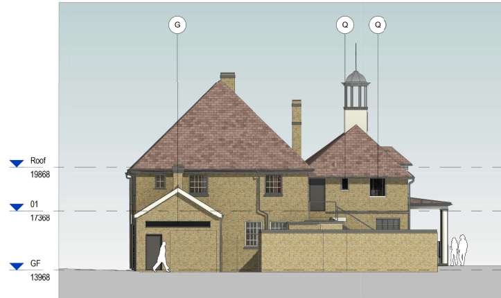
4 WEST ELEVATION - PROPOSED 1 : 100