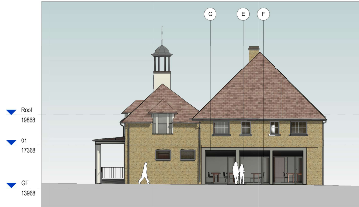
2 EAST ELEVATION - PROPOSED 1 : 100