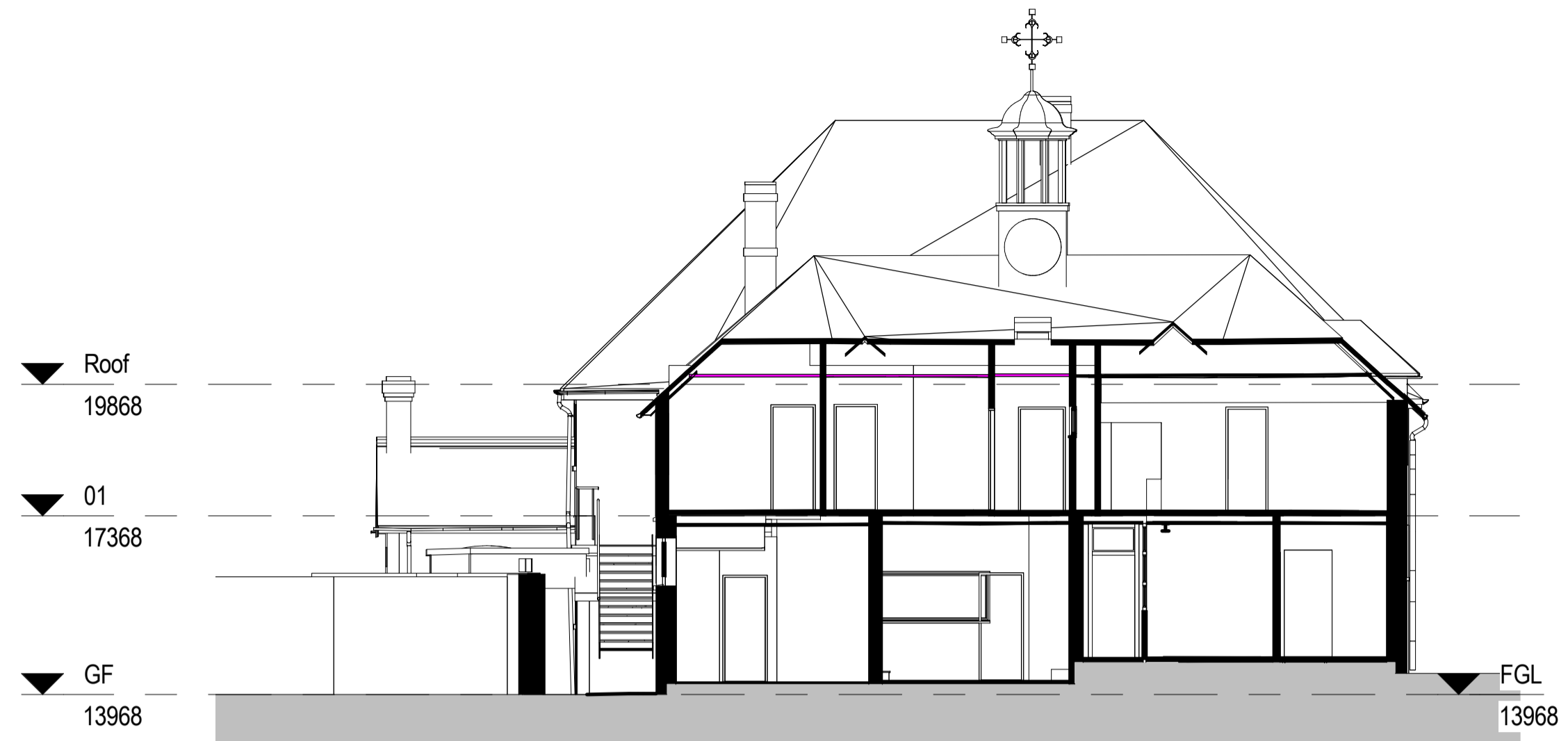
2 SECTION BB EXISTING 1 : 100