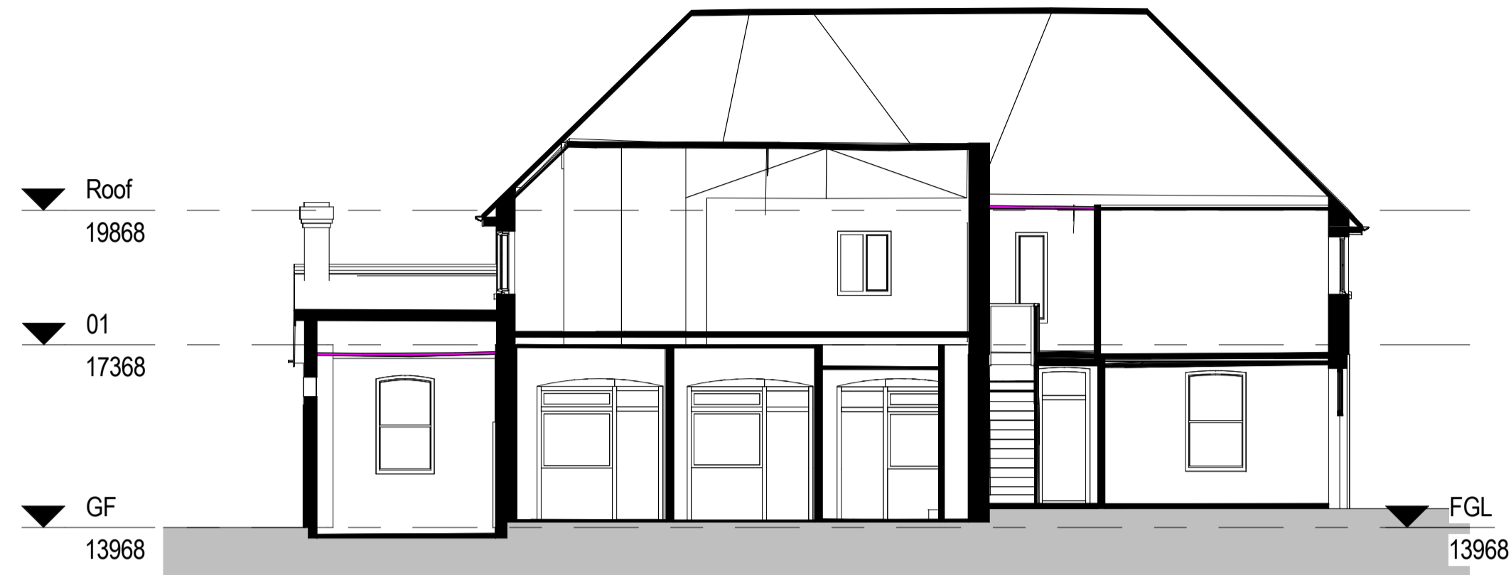
1 SECTION AA EXISTING 1 : 100