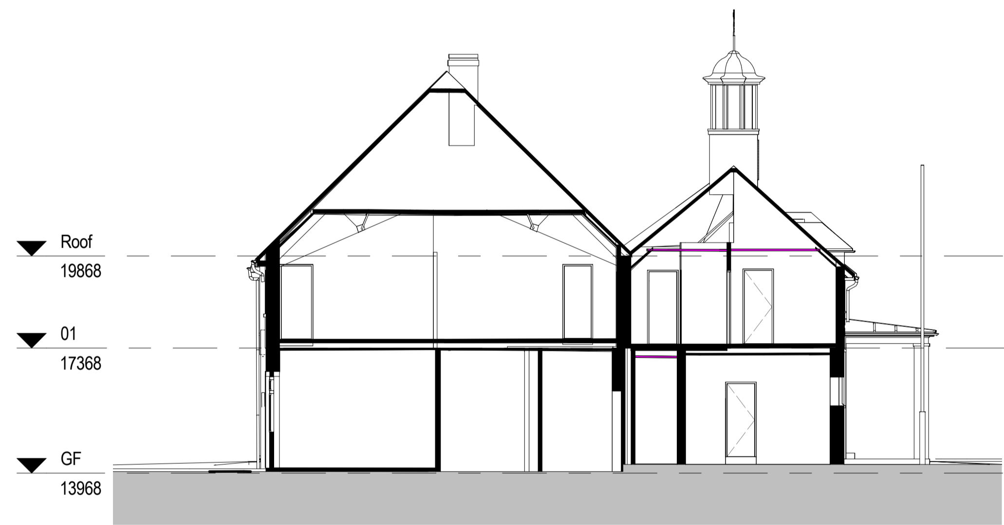
3 SECTION CC EXISTING 1 : 100