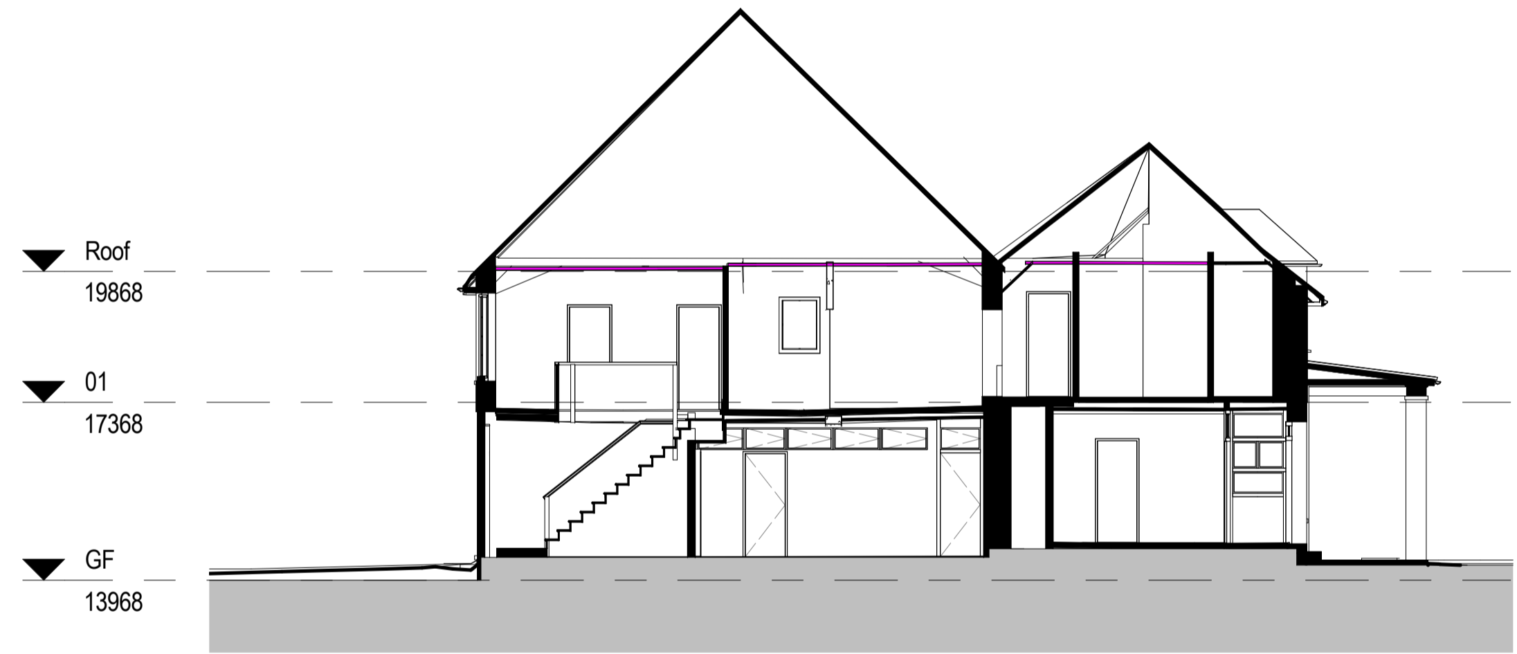
4 SECTION DD EXISTING 1 : 100