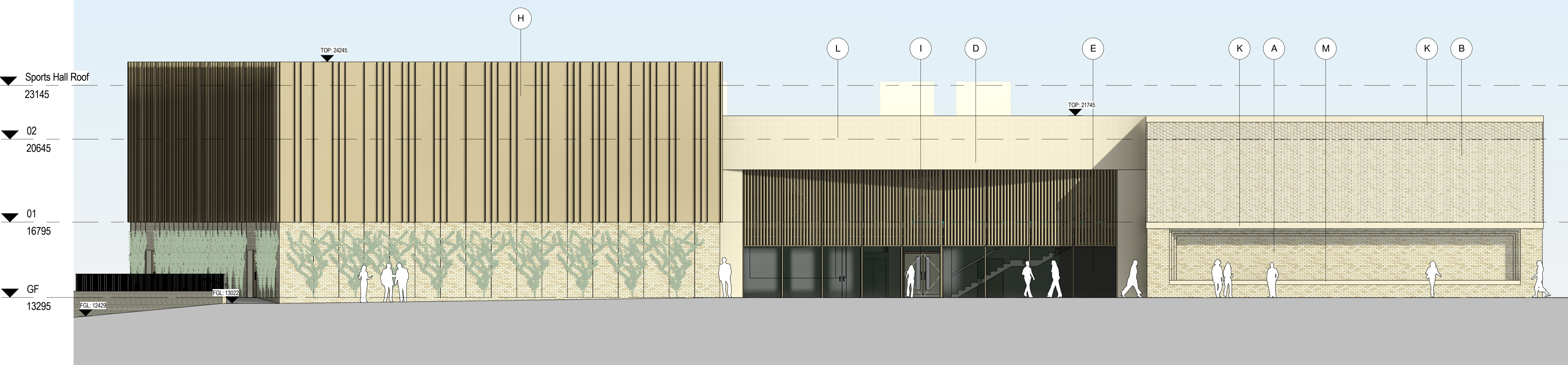
3 WEST ELEVATION 1 : 100