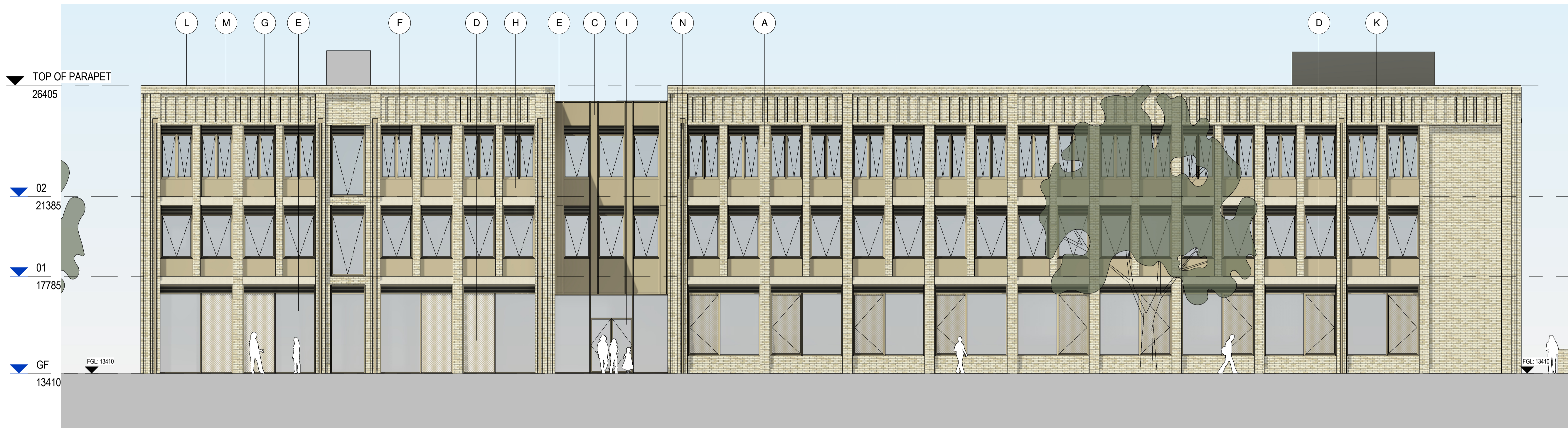
1 EAST ELEVATION 1 : 100