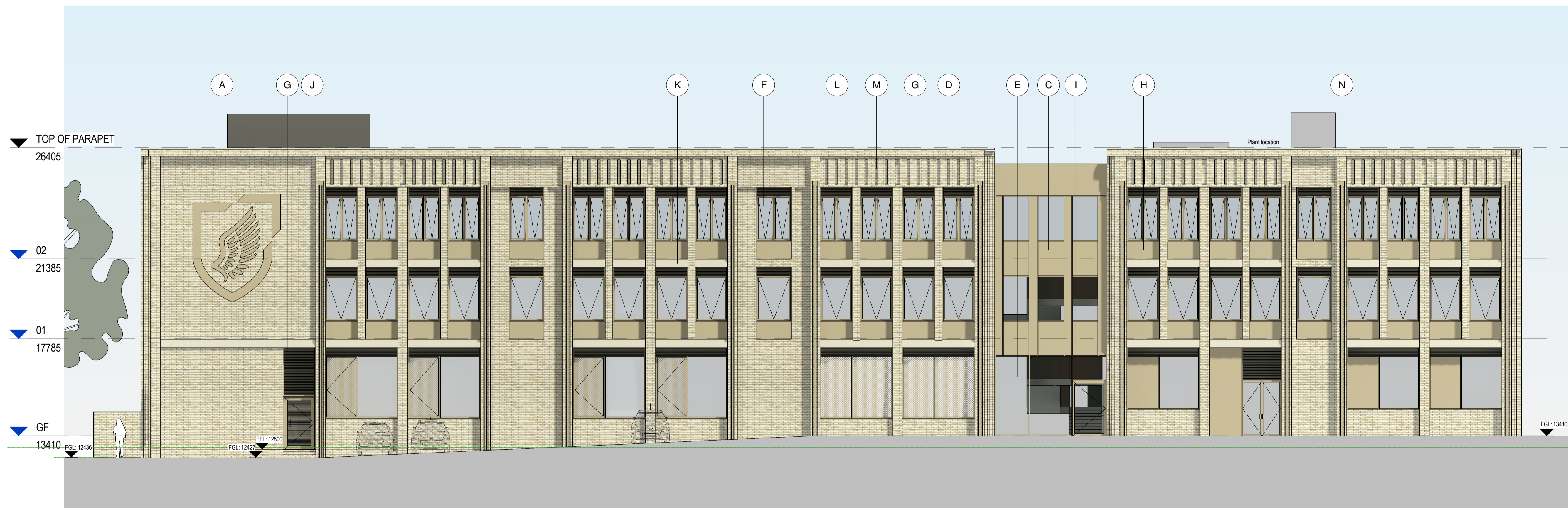
2 WEST ELEVATION 1 : 100