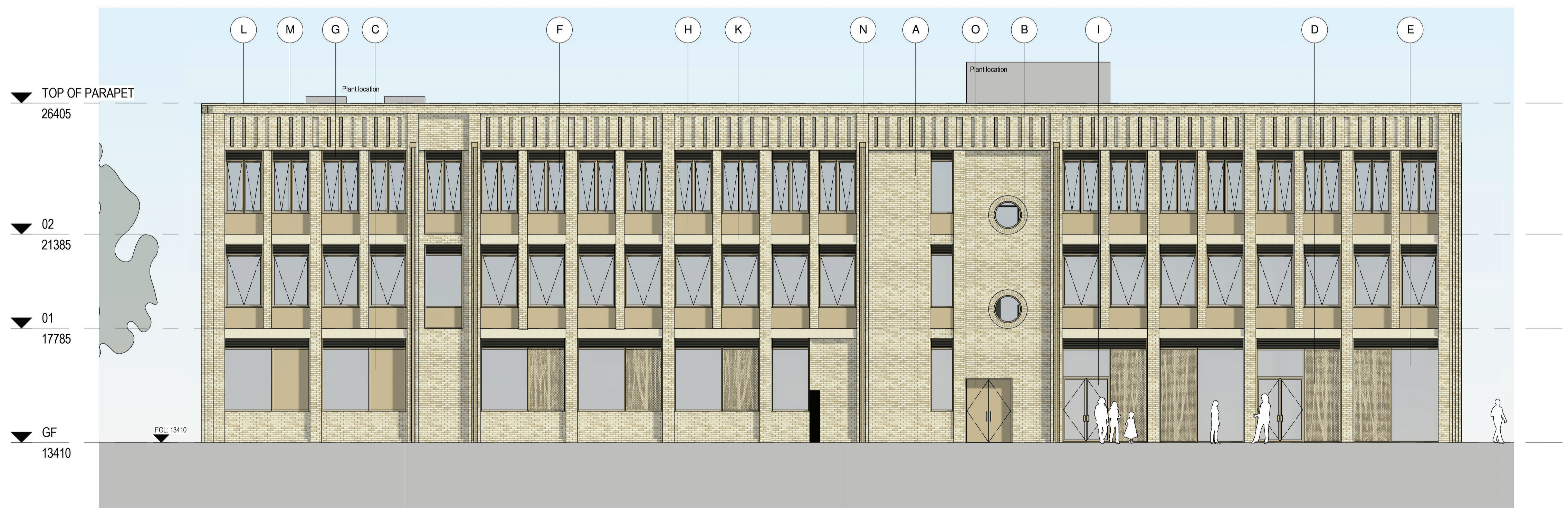
2 SOUTH ELEVATION 1 : 100