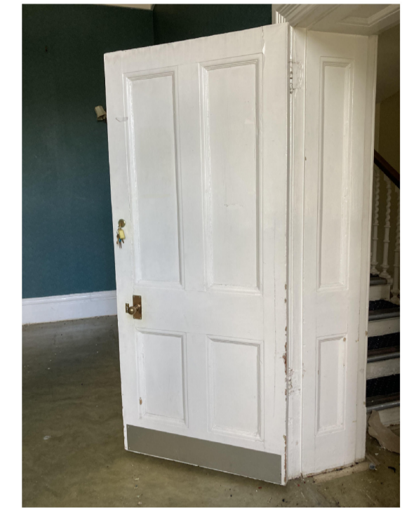
Image 1: Leaf Replacement (Historic) Proposed doors will match existing paneled door in G15 Final Specification TBC

READ IN CONJUNCTION WITH ADP-01-XX-SC-A-1050-S2-P1 - ROOM BY ROOM ALTERATIONS SCHEDULE LXA-1629-KH-122 - KNELLER HALL SCHOOL - PROPOSED FLOOR FINISHES EXTERNAL FABRIC REPAIRS WILL BE SUBMITTED AS A DEDICATED AND SEPARATE LISTED BUILDING APPLICATION