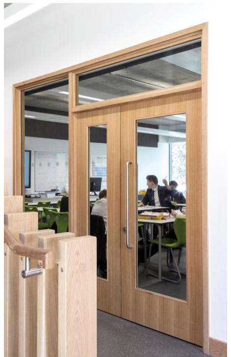
Image 2: Leaf Replacement (Contemporary) Proposed doors are a contemporary appearance with glazed screens Final Specification/Finish TBC