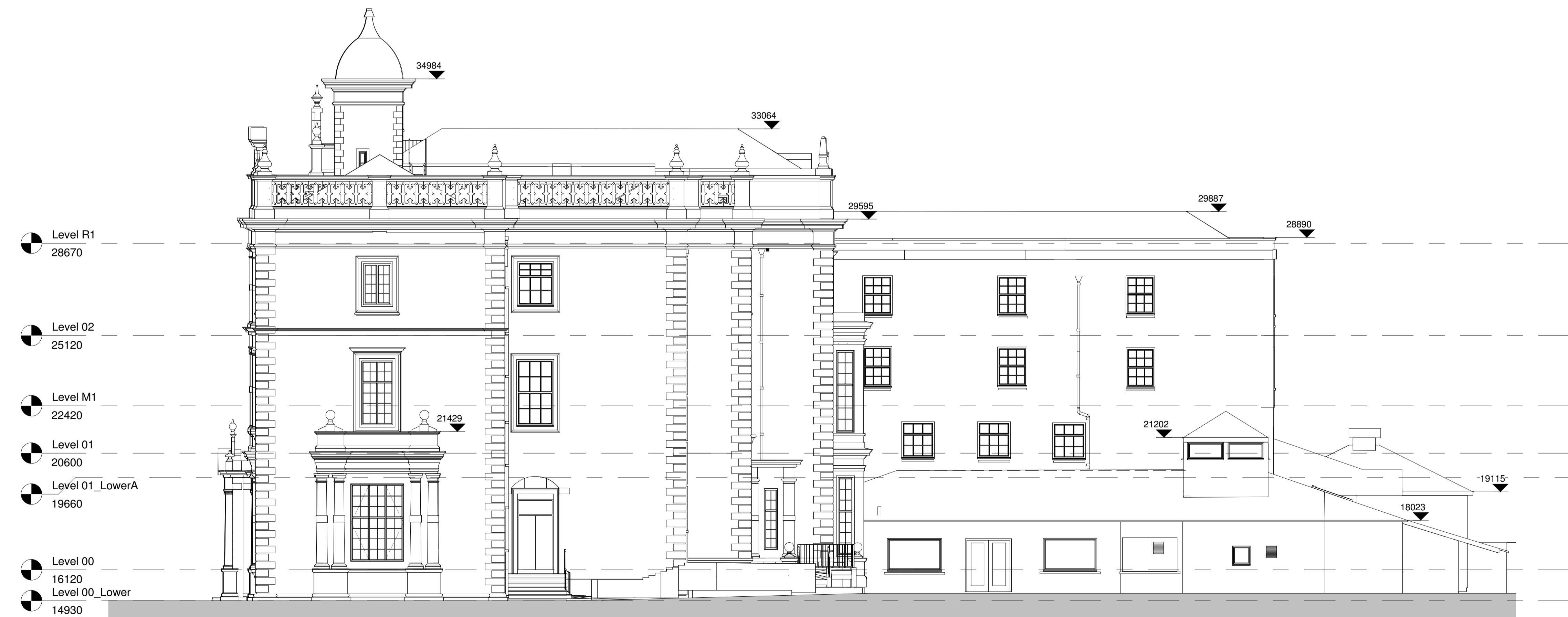
2 EAST ELEVATION - EXISTING 1 : 100