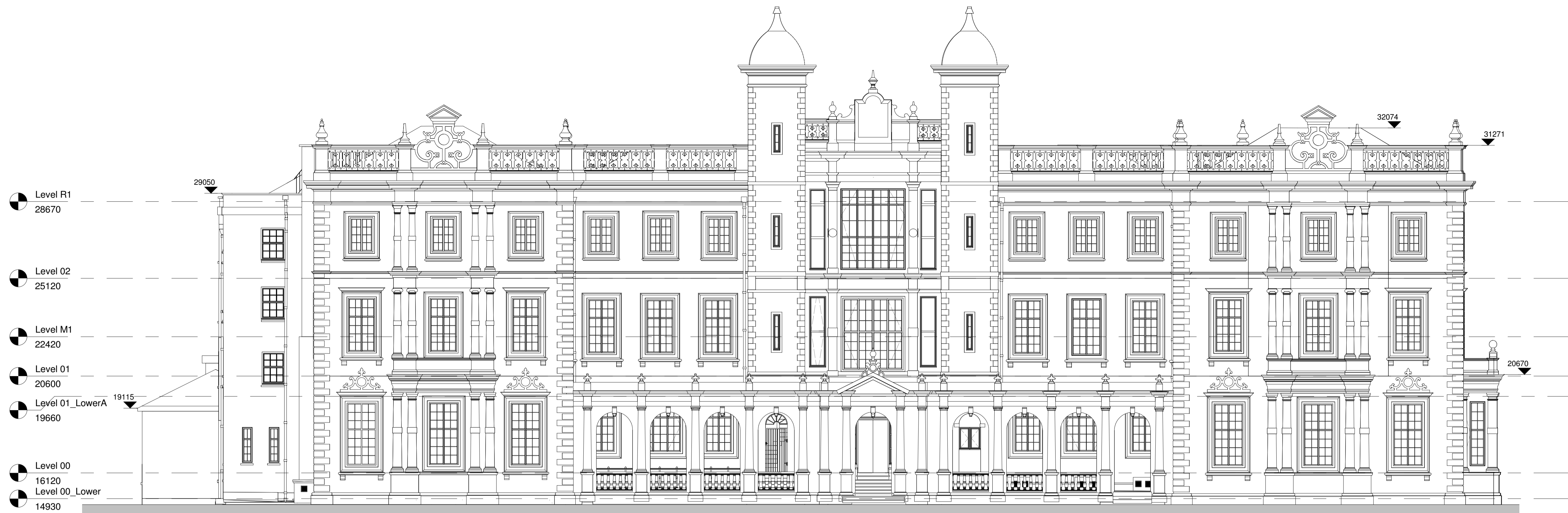
1 SOUTH ELEVATION - EXISTING 1 : 100