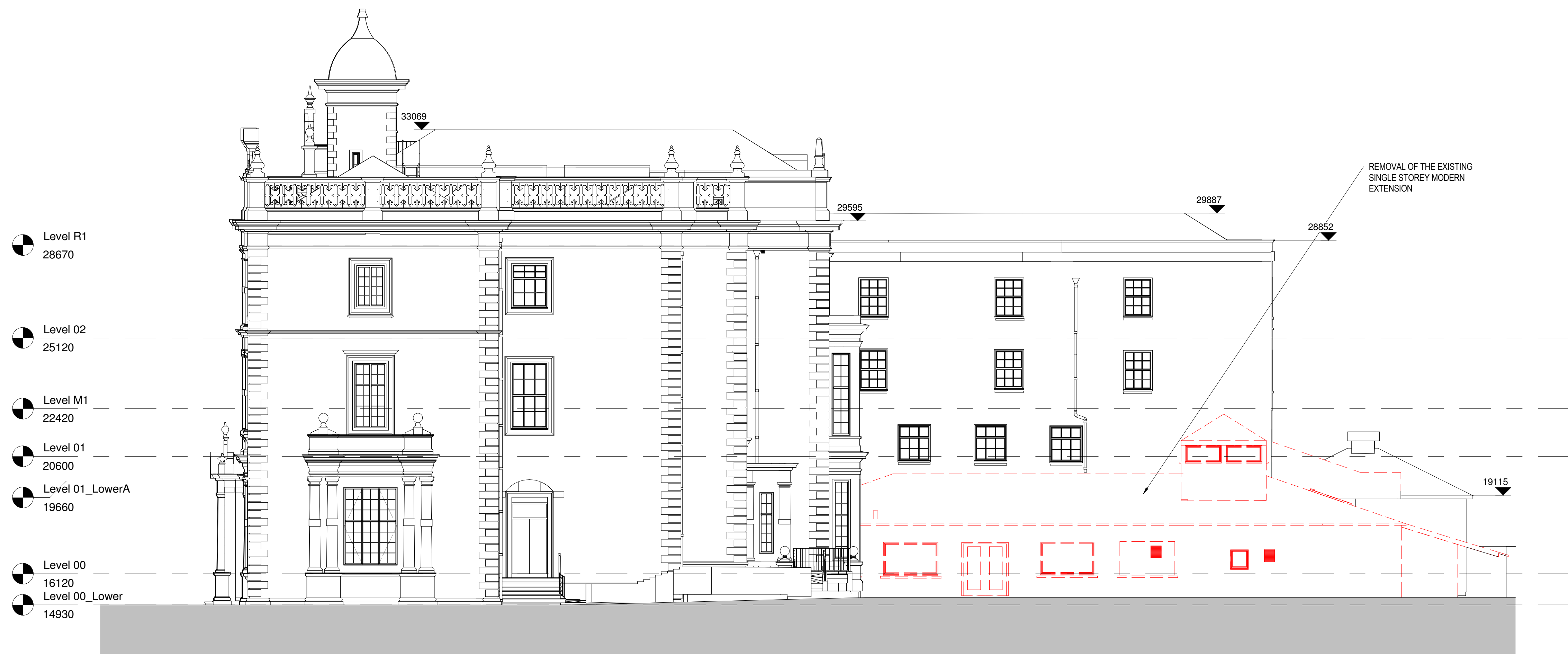
2 EAST ELEVATION - DEMOLITION 1 : 100