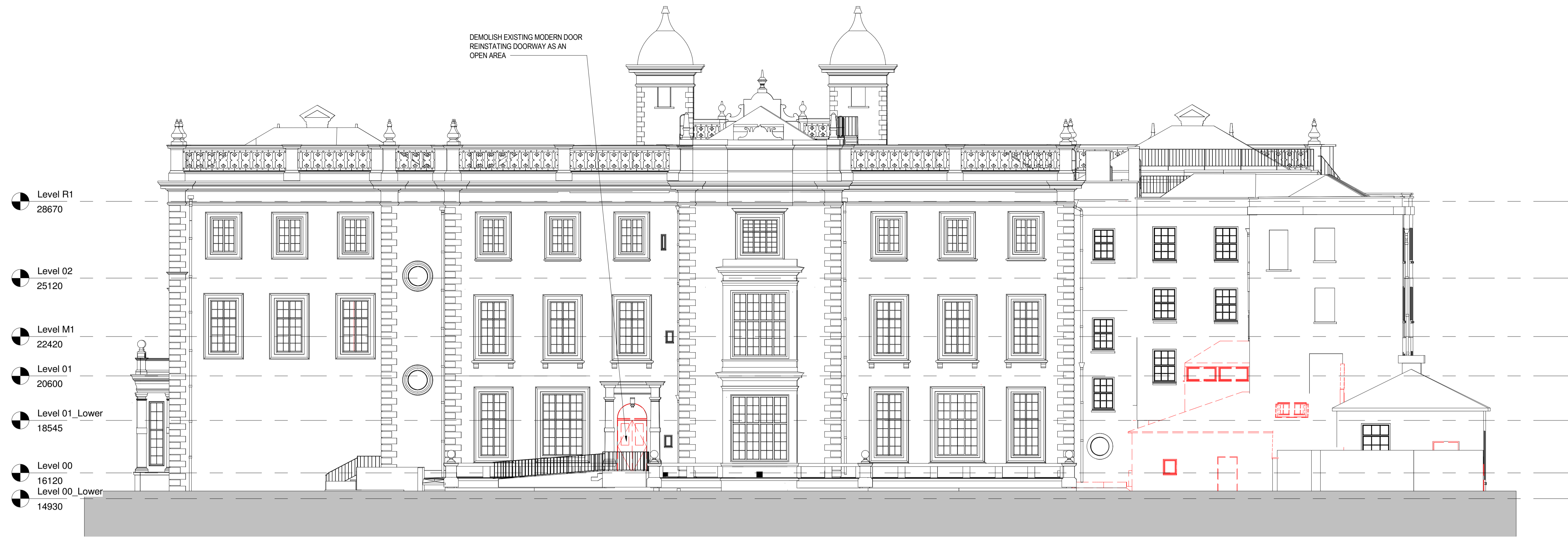
1 NORTH ELEVATION - DEMOLITION 1 : 100