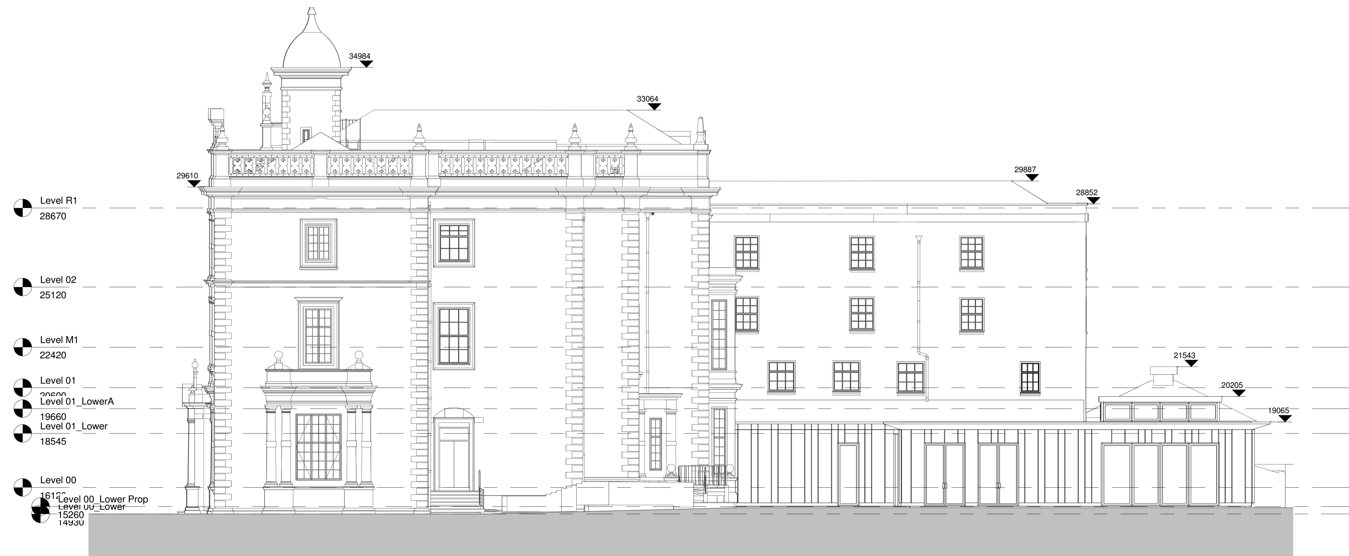
2 EAST ELEVATION - PROPOSED 1 : 100