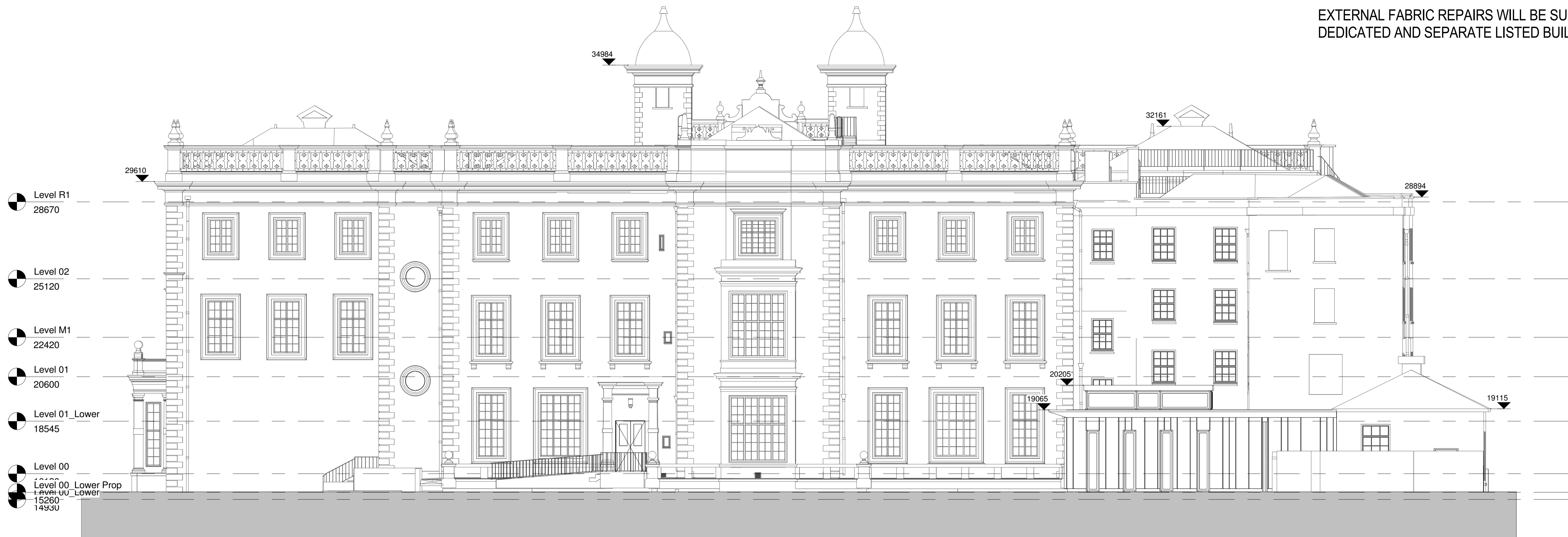
1 NORTH ELEVATION - PROPOSED 1 : 100

EXTERNAL FABRIC REPAIRS WILL BE SUBMITTED AS A DEDICATED AND SEPARATE LISTED BUILDING APPLICATION