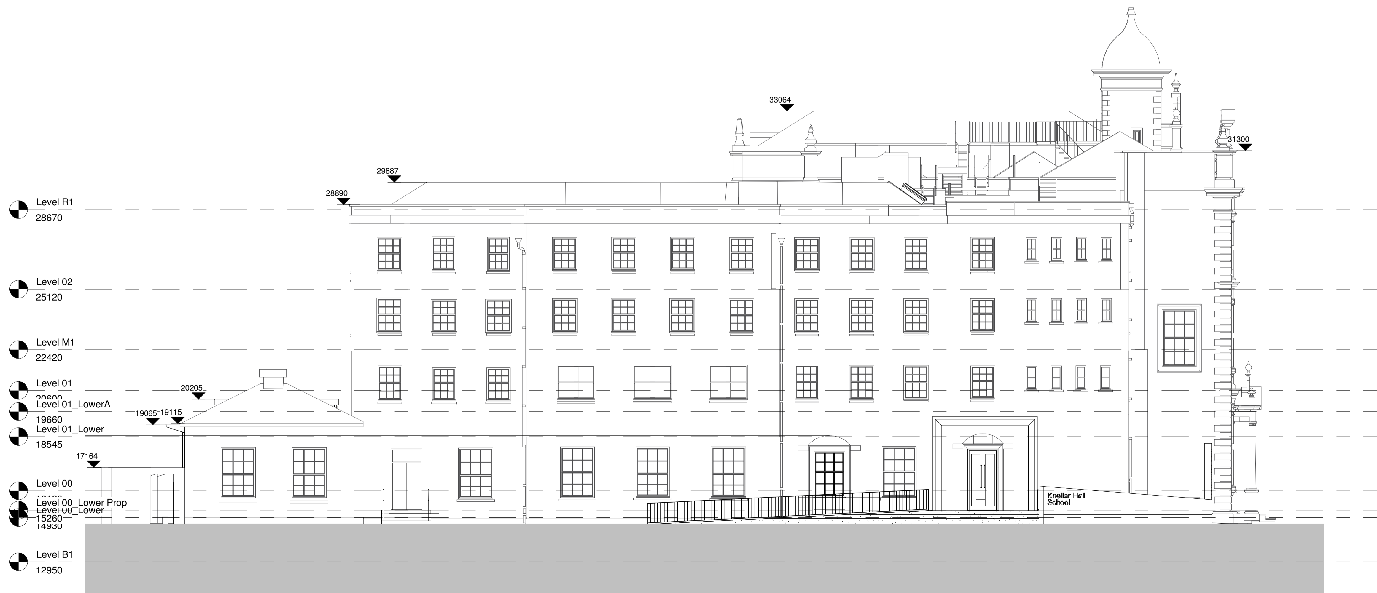
2 WEST ELEVATION - PROPOSED 1 : 100